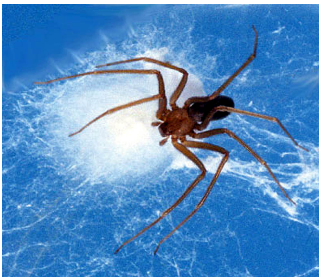
Figure 8. Female brown recluse spider, Loxosceles reclusa Gertsch & Mulaik, with eggsac.

even by the female (perhaps these were infertile). The egg stage averaged about 13 days, instars I-VIII 17, 110, 63, 41, 38, 34, 40, and 53 days respectively. Maximum age for a brown recluse from emergence to death was 894 days for a female, 796 for a male. A laboratory-kept specimen lived over six months without food or water. Captive specimens also proved moderately resistant to pesticides. These two characteristics illustrate why brown recluse populations may exist in buildings for long periods of time, despite repeated efforts to eradicate them.