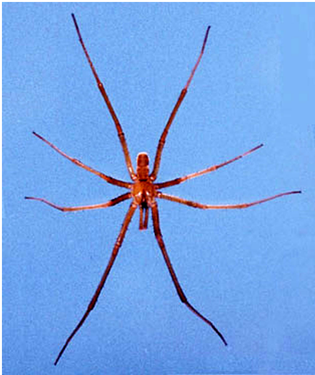
Figure 4. Male southern house spider, Kukulcania hibernalis (Hentz).