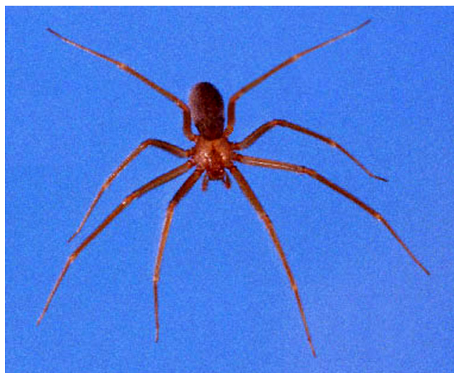
Figure 1. Female brown recluse spider, Loxosceles reclusa Gertsch & Mulaik.

I called the Florida Poison Control Network to confirm these numbers, and was cited 182 total cases and 96 in the Tampa region. The actual numbers are less important than the fact that a significant number of unconfirmed brown recluse spider bites are reported in the state every year. Yet not one specimen of brown recluse spider has ever been collected in Tampa, and the only records of Loxosceles species in the entire region are from Orlando and vicinity. A general review of the brown recluse, along with a critical examination of the known distribution of