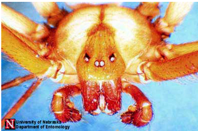
Figure 5. The three pairs of eyes that help identify the brown recluse spider, Loxosceles reclusa Gertsch and Mulaik.

in humans. Occasionally, the huntsman spider, Heteropoda venatoria (Linnaeus), is misidentified as a brown recluse (Edwards 1979). However, the color pattern on the carapace of this species is reversed, with a light median mark on a dark background, and adults of this spider are much larger than a brown recluse.