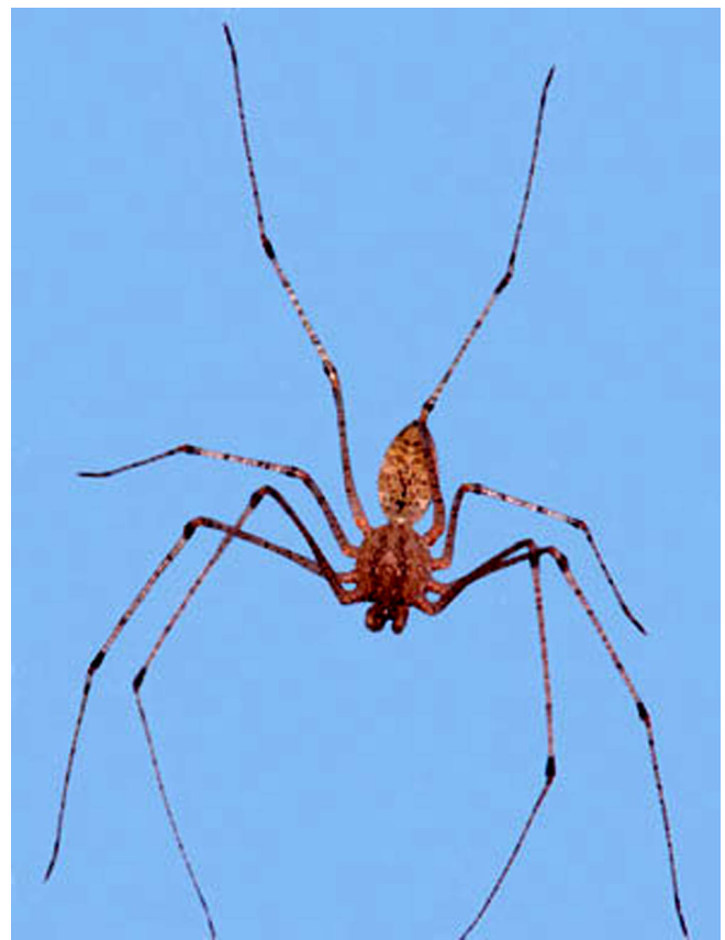
Figure 6. Female spitting spider, Scytodes sp.