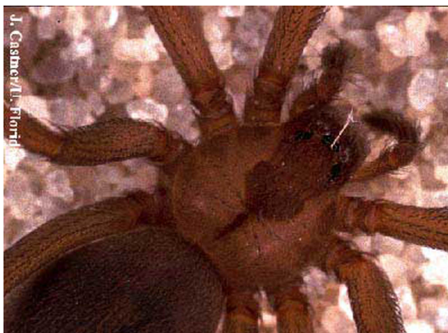
Figure 2. Detail of the carapace of the brown recluse spider, Loxosceles reclusa Gertsch and Mulaik, showing the dark fiddle-shaped marking often used to identify this spider.

The legs are slender and dusky orange to dark reddish brown. They are numbered front to back with Roman numerals (I, II, III, IV). In females, the leg length formula, longest to shortest, is II, IV, I, III, typically with leg II being over 18 mm in length, and leg III about 15 mm, the other two pair intermediate in length. The male leg formula is II, I, IV, III, with leg II over 24 mm and leg III about 17 mm. The abdomen of both sexes is tan to brown, but it may appear darker if the spider has recently fed. Juveniles are paler in all respects, as are occasional adults.