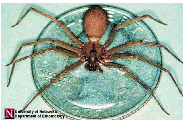
Figure 3. Adult brown recluse spider, Loxosceles reclusa Gertsch and Mulaik, showing leg length relative to a US quarter.

Males of the common southern house spider, Kukulcania (= Filistata ) hibernalis (Hentz), are frequently confused with the brown recluse (Edwards 1983). The male palp length of L. reclusa is under 4 mm, considerably less than the superficially similar crevice spider. Another difference between the two species is that L. reclusa has six eyes composed of three isolated pairs (dyads), whereas K. hibernalis has eight eyes all clumped together in the middle front of the carapace.