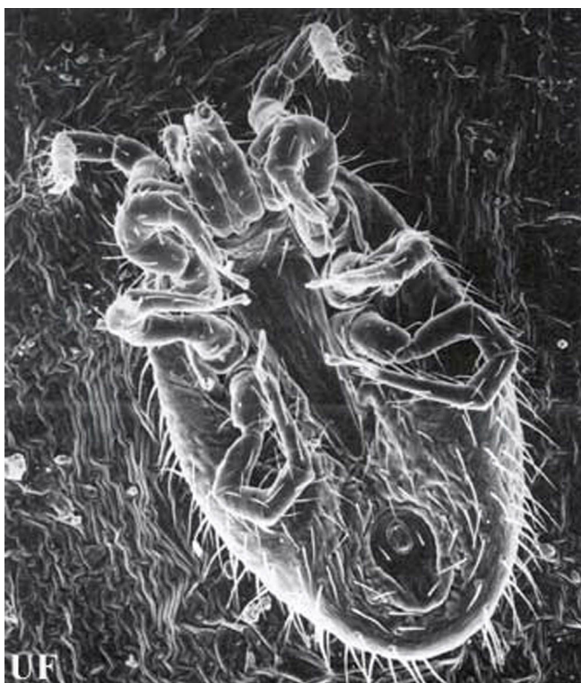
Figure 1. Scanning electron microscope (SEM) photograph showing ventral view of the tropical fowl mite, Ornithonyssus bursa (Berlese).