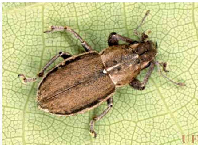
Figure 1. Dorsal view of an adult female whitefringed beetle, Naupactus sp.

Originally from South America (Argentina, Peru, Chile, Uruguay), whitefringed beetles are now widely distributed throughout the southern United States (AL, AK, FL, GA, LA, MO, MS, NC, SC, TN, TX, VA) and occur in New Zealand (Buchanan 1939, 1947; Warner 1975).