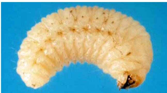
Figure 4. Larva of a whitefringed beetle, Naupactus sp.

Larva: Mature larva about 12 mm long; creamy yellowish-white; C-shaped with a strong thoracic swelling.