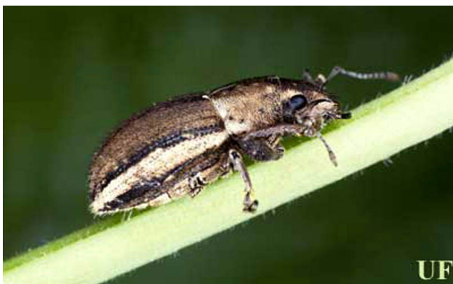
Figure 3. Lateral view of an adult female whitefringed beetle, Naupactus sp.

Egg: About 0.9 mm long X 0.6 mm wide; newly laid egg white, turning light yellow after four to five days.