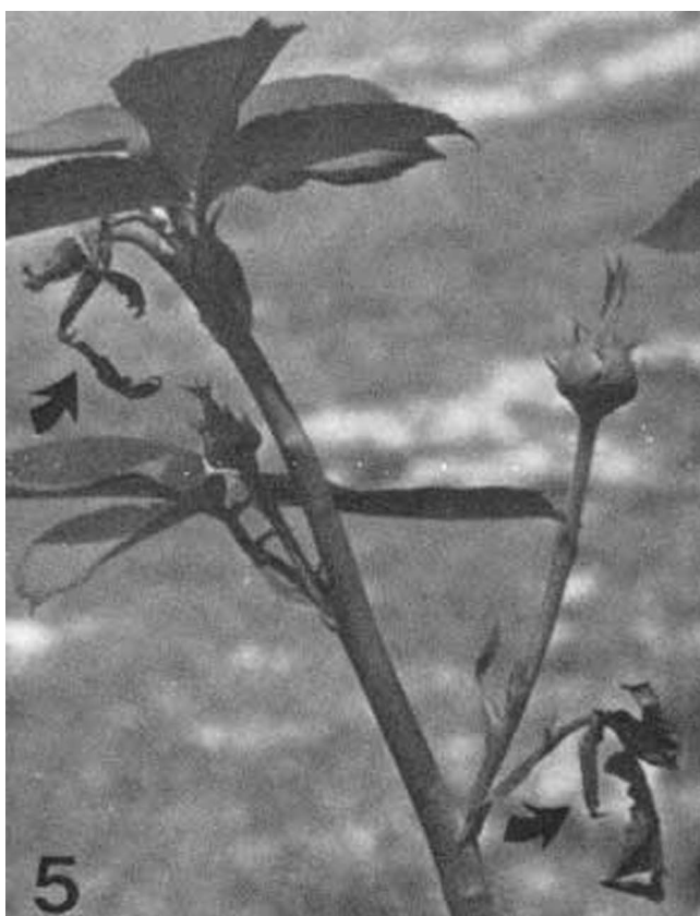
Figure 5. Wilting and withering of young rose leaves resulting from feeding by Euthochtha galeator (Fabricius), a leaf-footed bug.

stout-bodied adults (16 mm long, 6 mm wide) on young stems, foliage or buds. Place nymphs and adults in vial of 70% isopropyl alcohol for submission to entomology for identification.