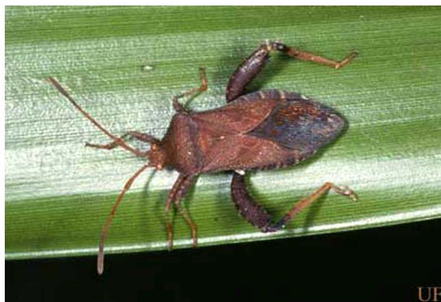
Figure 3. Adult Euthochtha galeator (Fabricius), a leaf-footed bug.

Length 13 to 17 mm; width 5 to 7.5 mm. Color dull brown, membrane darker; connexivum spotted in some, nearly concolorous in other specimens. Pronotum with anterior part of lateral margins finely and irregularly toothed. Humeri prominent but not spined. Hind femora swollen, especially in males, and with spines underneath, tubercles above.