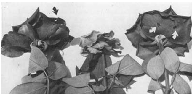
Figure 6. Larger rose blossoms, showing punctures and smaller blossom of a different variety partially distorted by feeding injury caused when bud was fed on by Euthochtha galeator (Fabricius), a leaf-footed bug.

Most likely cultivated host plants are roses and to a lesser extent fruits, such as citrus and lychee. Wild hosts include composites, wild plums, polygala, grasses, sedges, nettles, sumac, young growth of hickory and oak, mint, etc.