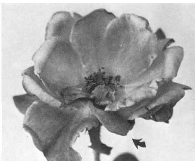
Figure 4. A rose blossom showing uneven development caused by feeding of Euthochtha galeator (Fabricius), a leaf-footed bug.

Look for a patch of golden-colored eggs on either surface of a leaf; detach leaf and submit in pillbox or plastic bag. Look for spiny nymphs, having dilated 3rd antennal segment, on succulent stem near cluster of terminal young leaves. Look for brownish,