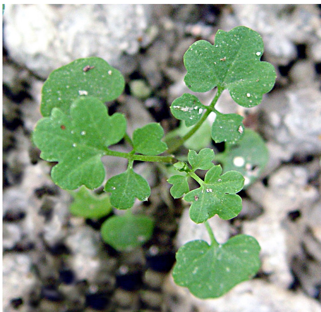
Figure 3. Hairy bittercress plants often have leaflets that are club-shaped (as in a deck of playing cards).

Hairy bittercress is classified as a winter annual, that is, a plant that germinates in fall or winter and flowers in the spring. In Florida nurseries, it will be most prevalent during the cooler months, but it can germinate and flower any time of the year.