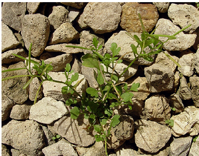
Figure 1. Hairy bittercress in a gravel bed.

Container nursery growers frequently cite bittercress as one of their more common weed problems. Not only is it a weed concern, but bittercress can harbor insect pests.