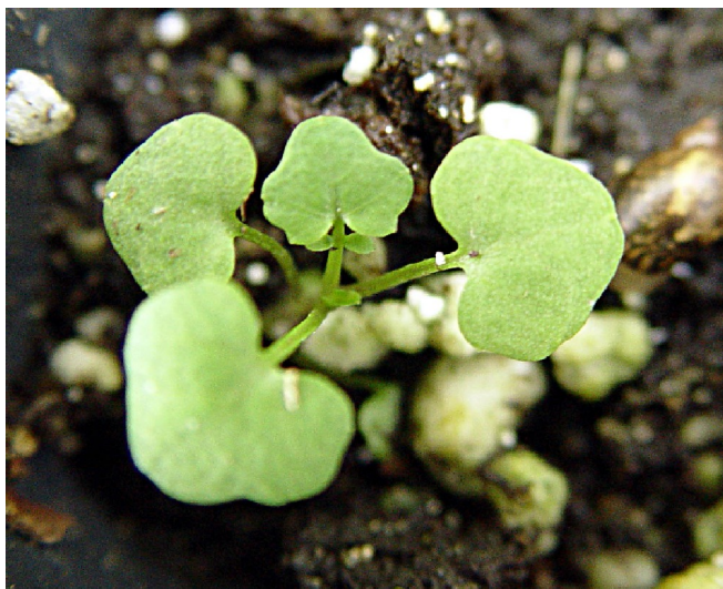
Figure 2. Leaves of hairy bittercress seedlings are distinct enough to make bittercress relatively easy to spot.