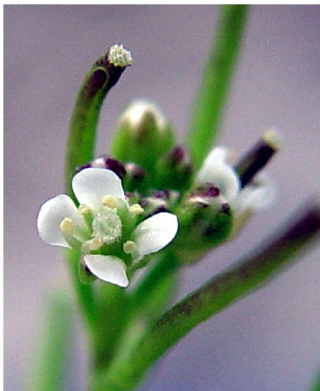
Figure 4. Closeup of a hairy bittercress flower. The tiny white flowers occur in clusters at the end of the shoots.

Bachman and Whitwell (1994) reported that hairy bittercress plants are capable of producing over 5000 seed, most of which can germinate within 2 weeks after being dispersed. Seed that don't land in pots or germinate can easily spread via irrigation or rain runoff, moved on the soles of workers' shoes, or they can be transported on unwashed pots.