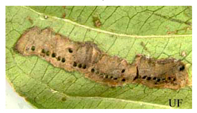
Figure 9. Parasitized egg mass of the glassy-winged sharpshooter, Homalodisca coagulata (Say).

Cultural: Cultural control methods include removing other host plants such as weeds and fruit trees from the area. Finding X. fastidiosa-resistant rootstocks may also be a possible way of limiting the