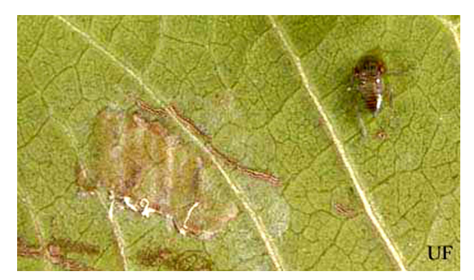
Figure 5. Neonate nymph and egg mass of the glassy-winged sharpshooter, Homalodisca coagulata (Say).

However, brochosomes are not produced in the same way at all stages of the life cycle. Females, like males and nymphs of H. coagulata and other species of the tribe Proconiini, produce spherical brochosomes until they have mated, at which time they begin to make rod-shaped brochosomes for the covering of egg masses (Rakitov). Spherical brochosomes are only used for covering the integument after ecdysis. Development is hemimetabolous. Populations reach their peak around the summer months, and begin to decline late August. As winter approaches, adults migrate into forest areas and undergo incomplete hibernation in wait of spring. Mating occurs in the spring and summer.