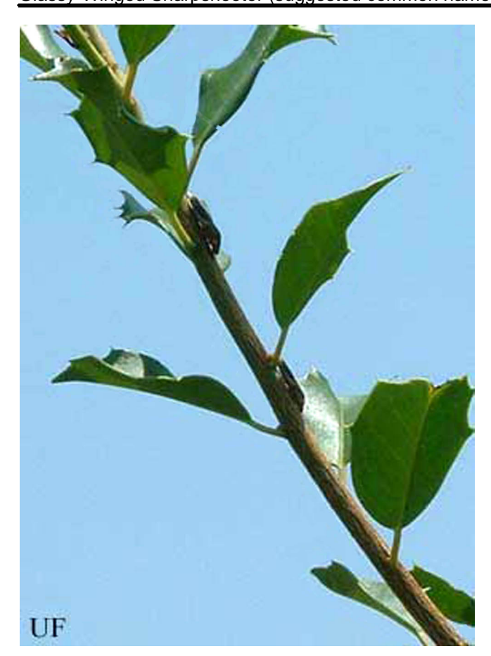
Figure 7. Adult glassy-winged sharpshooters, Homalodisca coagulata (Say), feeding on holly.

well-studied. In Florida, however, natural infectivity of the glassy-winged leafhopper is very low (Alderz and Hopkins). As to the vector efficiency of the glassy-winged sharpshooter, Costa et al. (2000) found that, under ideal conditions, 83% of oleander plants each exposed to a single leafhopper carrying X. fastidiosa became infected with the bacterium.