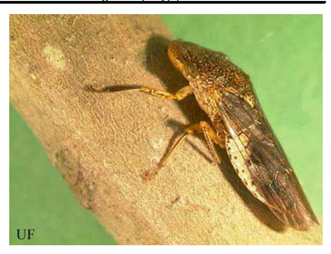
Figure 3. Adult glassy-winged sharpshooter, Homalodisca coagulata (Say). Credits: Tracy Conklin, University of Florida

The female glassy-winged sharpshooter lays her eggs in groups of three to 28 eggs just under the epidermis layer of several well-chosen leaves. Preferred plants for oviposition may include holly, sunflower and citrus. Strict nutrient requirements for young nymphs are believed to be important factors in the choice of plants for oviposition. As the female