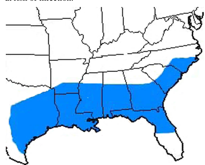
Figure 1. Distribution of the glassy-winged sharpshooter, Homalodisca coagulata (Say), in the southeast United States. Credits: Tracy Conklin, University of Florida

include several counties in southern California, most likely having been introduced to the state through the nursery industry. The map of California (courtesy of the California Department of Agriculture) shows the current distribution of the glassy-winged sharpshooter in southern California and the counties at risk of infection.