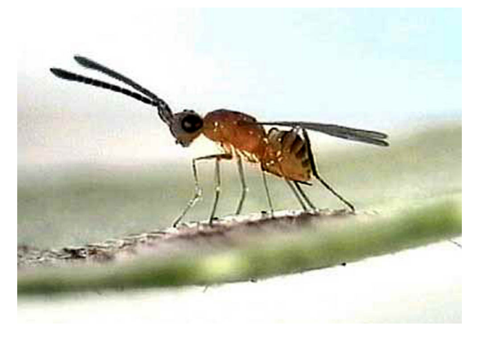
Figure 8. Adult Gonatocerus triguttatus , a wasp parasitoid, lays its eggs in glassy-winged sharpshooter eggs embedded in a leaf.

Biological: In the area of biological control, a species of parasitic wasp ( Gonatocerus triguttatus ) has been introduced into California in an effort to control the early spring generation of the sharpshooter. The tiny wasp from Texas and Northern Mexico is an egg parasite of the sharpshooter, laying its eggs within the eggs of the sharpshooter (Triapitsyn and Phillips). Research is also underway to promote the use of entomopathogens such as Hirsutella sp., a fungus that is known to affect sharpshooters in the southeastern United States.