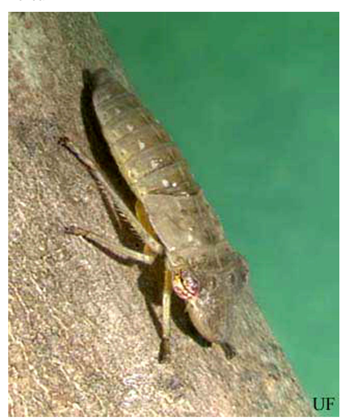
Figure 4. Nymph of the glassy-winged sharpshooter, Homalodisca coagulata (Say).

lays her eggs, she covers them with a white material scraped from deposits on her fore wings. This white powder is termed brochosomes, consisting of intricately structured hydrophobic particles. Brochosomes are produced in specialized secretory segments of the malphigian tubules, and are excreted by leafhoppers to cover their bodies and egg masses.