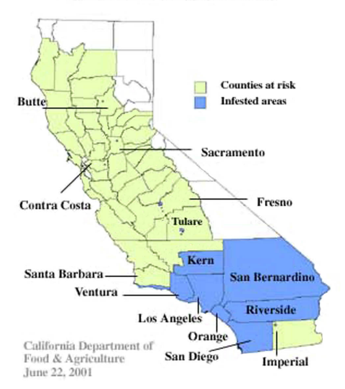
Figure 2. Distribution of the glassy-winged sharpshooter, Homalodisca coagulata (Say), in California.