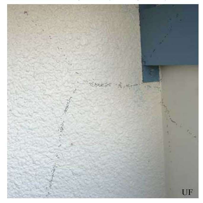
Figure 5. White-footed ants, Technomyrmex albipes (Fr. Smith), trailing on a building.

and on structures, foragers tend to follow lines, such as an edge of an exterior wall panel, which eventually leads to some small opening to the interior, where foragers that enter become more noticeable to occupants. Frequently, WFA find their way inside wall voids where they follow electrical cables and emerge into various rooms, especially kitchens and bathrooms, where liquid and solid foods can be encountered resulting in heavy trailing activity.