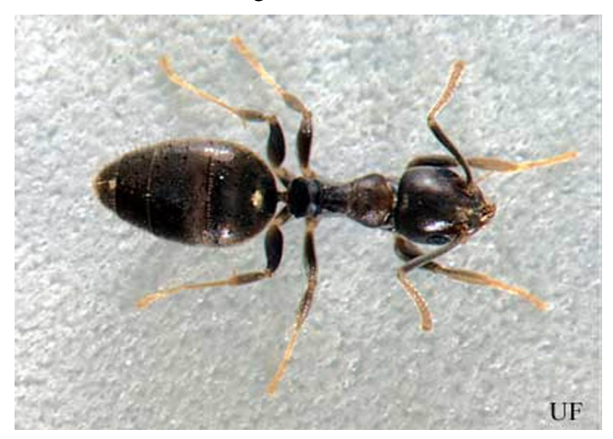
Figure 3. Worker of the white-footed ant, Technomyrmex albipes (Fr. Smith).

The WFA is a medium small (2.5-3 mm long), black to brownish-black ant with yellowish-white tarsi (feet) and a one-segmented waist. A member of the subfamily Dolichoderinae, WFA have five abdominal segments, 12-segmented antennae, few erect hairs, and no sting.