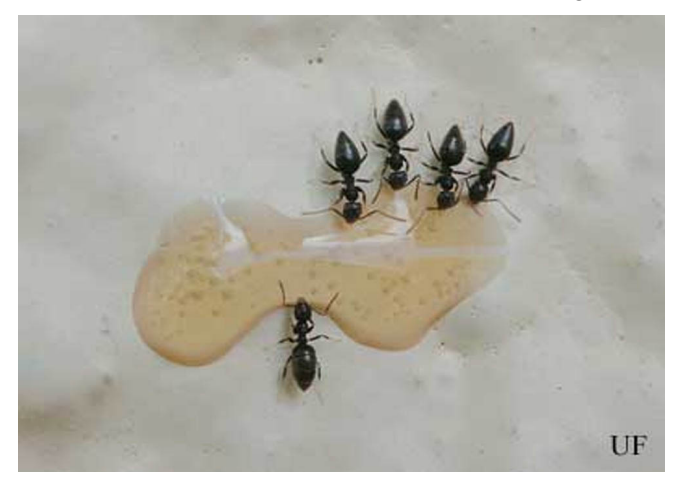
Figure 2. White-footed ants, Technomyrmex albipes (Fr. Smith), feeding on soda droplet.