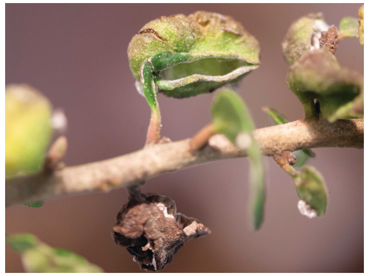
Figure 6. A recently opened leaf gall.