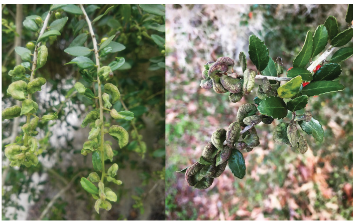
Figure 8. Younger, green galls on a weeping llex vomitoria (left), and older galls on a wild-type llex vomitoria , showing purplish coloration (right).

Galls are more frequently observed on wild type or weeping forms of Ilex vomitoria . Gall-forming psyllids in general are believed to induce gall formation through the saliva they inject while feeding. This saliva probably contains chemicals which cause the plant to form galls; however, little research has been done on these in psyllids. Besides protecting nymphs from predators and harsh environmental conditions, galls may increase the nutritional value of older leaves (Hodkinson 1984).