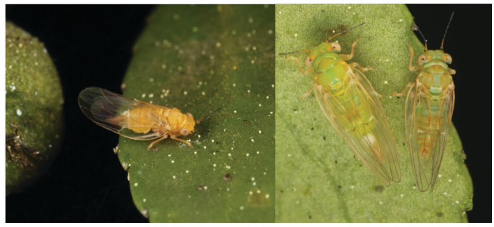
Figure 2. Adult Gyropsylla ilecis (Ashmead) showing color variation.

The adult yaupon psyllid is 5 to 6 mm (0.2 in) long and usually yellowish, although color varies from bright green to orange-red (Figure 2). Antennae are brown and threadlike. Adults have jumping legs and transparent wings held roof-like over their abdomens. Nymphs are flattened dorsoventrally and range from yellowish to orange-red. The abdomens of late instar nymphs may have a greenish tinge. They are often covered with a powdery white secretion which also lines their galls (Figure 3) (Mead 1983; Crawford 1914).