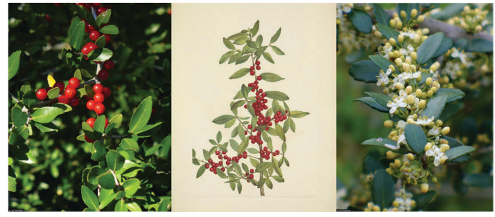
Figure 7. Yaupon holly, llex vomitoria Ait.