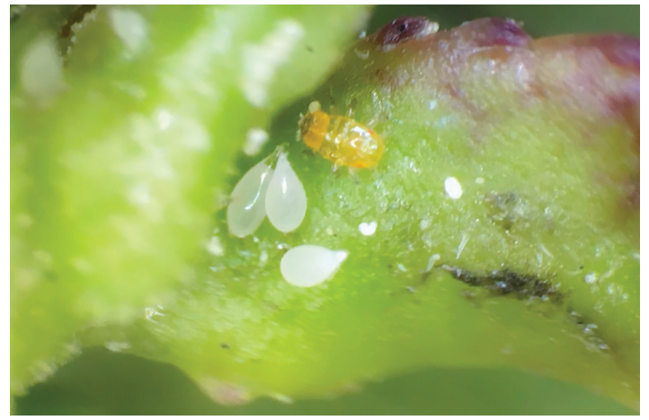
Figure 5. Gyropsylla ilecis (Ashmead) nymph and eggs on leaf bud.