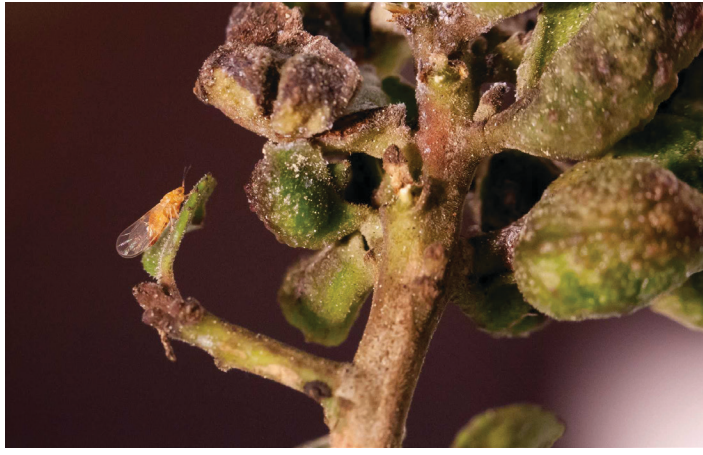
Figure 1. An adult yaupon psyllid, Gyropsylla ilecis (Ashmead) (left), with galls on yaupon holly, llex vomitoria .

The yaupon psyllid, Gyropsylla ilecis (Ashmead), is a native insect in the family Aphalaridae, order Hemiptera (Figure 1). The insect is inconspicuous during most of the year, but the leaf galls it produces in spring are readily observed. Nymphs feed on the new growth of yaupon holly, Ilex vomitoria , causing leaves to deform into a protective gall. The yaupon holly, native to the southeastern United States, is used as an ornamental tree or shrub and has also been used for centuries to produce a caffeinated, tea-like beverage. The yaupon psyllid is considered a minor aesthetic pest due to the unsightly presence of galls and some stunting of twigs. However, yaupon holly is rarely severely damaged by this insect.