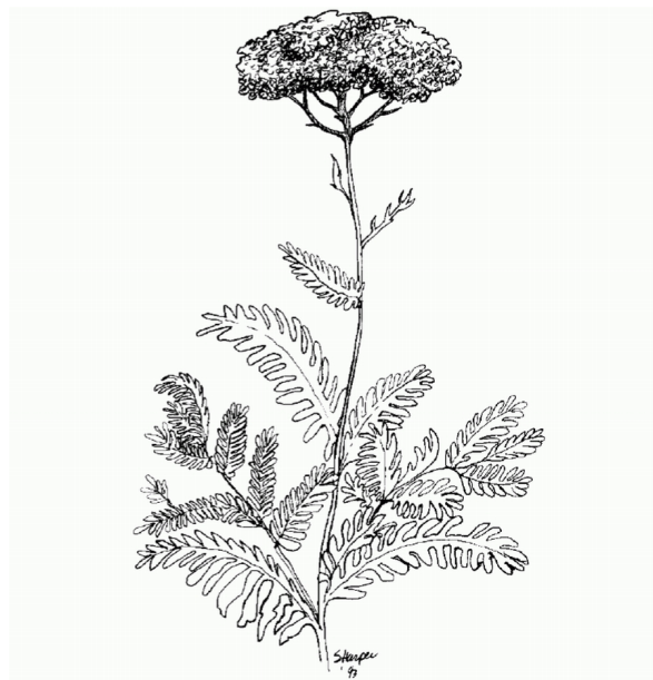
Figure 1. Yarrow.

Achillea species are 18- to 36-inch-tall perennials that bear masses of flowers throughout the summer (Figure 1). The 60 to 100 species of yarrow are ancient, spreading, semi-evergreen herbs that are long lived. The aromatic, finely divided leaves are alternate or in basal rosettes. The leaf margins range from simple and toothed to pinnately dissected. However, most of these species have attractive feathery or fern-like foliage. The flowers may be single or double and come in shades of pink, yellow and white; flower heads are mostly in fine-textured corymbs.