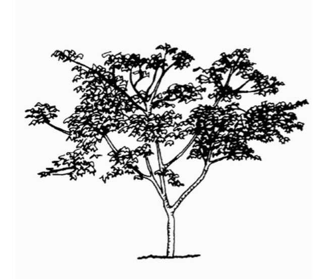
Figure 1. 'Vitifolium' full-moon maple.