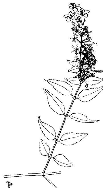
Figure 1. 'Edward Goucher' glossy abelia.

Glossy abelia is a fine-textured, semi-evergreen, sprawling shrub with 1.5-inch-long, red-tinged leaves arranged along thin, arching, multiple stems (Figure 1). It is a hybrid between A. chinensis and A. uniflora . It stands out from other plants because the leaves retain the reddish foliage all summer long, whereas many plants with reddish leaves lose this coloration later in the summer. Considered to be evergreen in its southern range, glossy abelia will lose 50% of its leaves in colder climates, the remaining leaves taking on a more pronounced red color. Reaching a height of 6 to 10 feet with a spread of 6 feet, the gently rounded form of glossy abelia is clothed from spring through fall with terminal clusters of delicate pink and white, small, tubular flowers. Multiple stems arise from the ground in a vase shape, spreading apart as they ascend into the foliage.