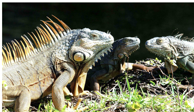
Figure 1. Adult green iguanas ( Iguana iguana) with male on the left.