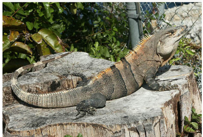
Figure 6. Adult female (top) and male (bottom) Mexican spiny-tailed iguana ( Ctenosaura pectinata ).

(spiny tailed iguanas). This habit of diving into the water to escape makes green iguanas very difficult to capture. Basilisks and anoles generally eat insects and