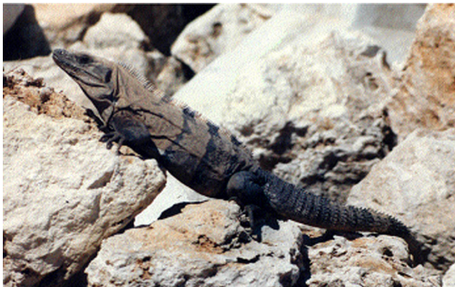
Figure 4. Adult male black spiny-tailed iguana ( Ctenosaura similis ).

green iguanas eat the droppings of adult iguanas to acquire the gut bacteria that help them digest plant material. Males are territorial against other males, but are not territorial against females and juveniles. These large lizards like to bask in open areas; sidewalks, docks, seawalls, landscape timbers, or open mowed areas. If frightened, they dive into water (green iguanas and basilisks) or retreat into their burrows