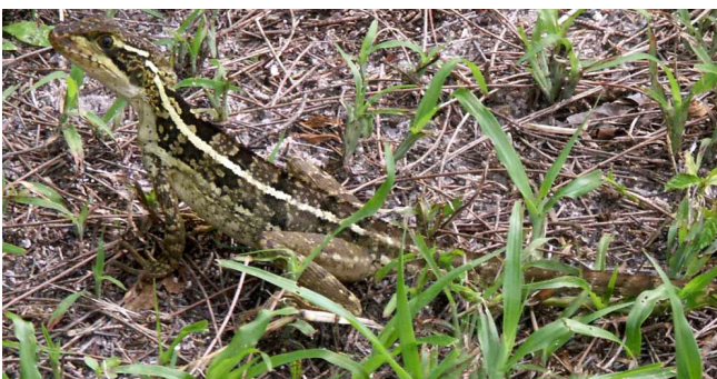
Figure 8. Juvenile brown basilisk ( Basiliscus vittatus).

small vertebrate prey, but Knight anoles occasionally eat small fruits and flowers as well.