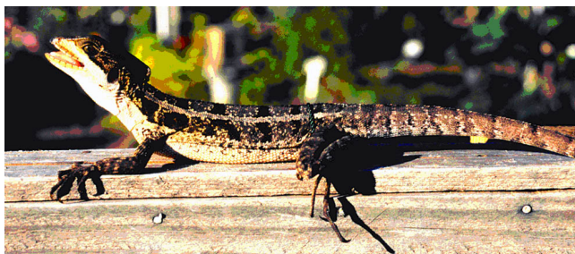
Figure 7. Female brown basilisk ( Basiliscus vittatus). Males are larger, brighter, with a much larger crest on the back of the head.