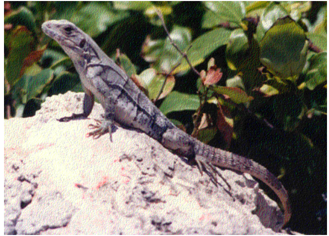
Figure 5. Female black spiny-tailed iguana ( Ctenosaura similis ).

green iguanas eat the droppings of adult iguanas to acquire the gut bacteria that help them digest plant material. Males are territorial against other males, but are not territorial against females and juveniles. These large lizards like to bask in open areas; sidewalks, docks, seawalls, landscape timbers, or open mowed areas. If frightened, they dive into water (green iguanas and basilisks) or retreat into their burrows