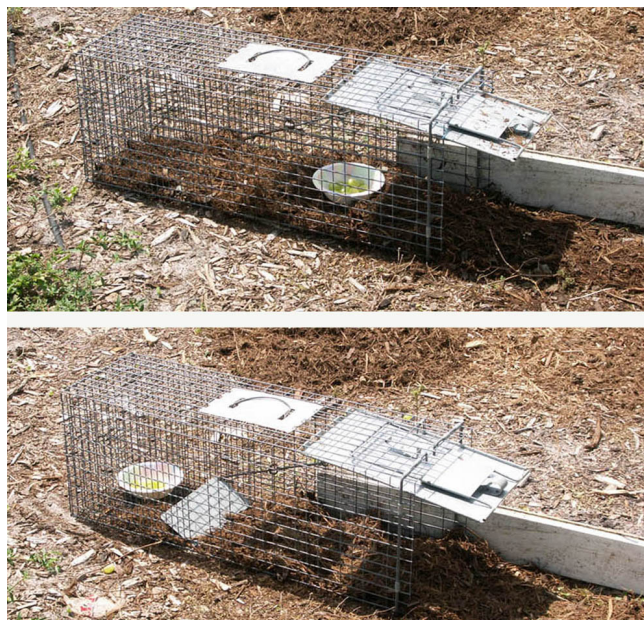
Figure 11. Live traps prebaited and wired open (top) and set (bottom) for iguanas. When you are prebaiting a trap, move the food farther into the cage each day the food is eaten. Cover the wire on the bottom with leaf litter, mulch, or soil so the lizard can't feel the wire under its feet. Use a drift fence (board) to help guide the animal in the trap.

Hunting with firearms is a very effective way to harvest iguanas for food in Central and South America. It is not legal or safe to discharge firearms (or pellet rifles) in suburban environments of South Florida where iguanas are commonly causing problems. Shooting is not recommended. Using a bow with tethered fishing arrows may be legal, but the humaneness is debatable. Check with local Florida Fish and Wildlife Conservation Commission officers or local law enforcement before using any projectile weapon. Slingshots with small pebbles or palm fruits may be a useful harassment tool, but should only be used under adult supervision and when you are very sure of your backstop. Rubber band guns have been used by scientist to collect small lizards and may stun juvenile iguanas long enough to capture them by hand.