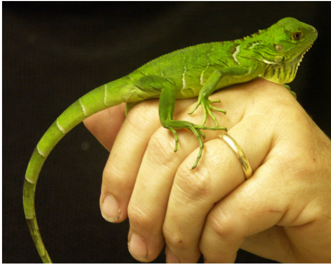
Figure 3. Juvenile green iguana. This hatchling is an attractive size for a pet or to sell to a pet store.