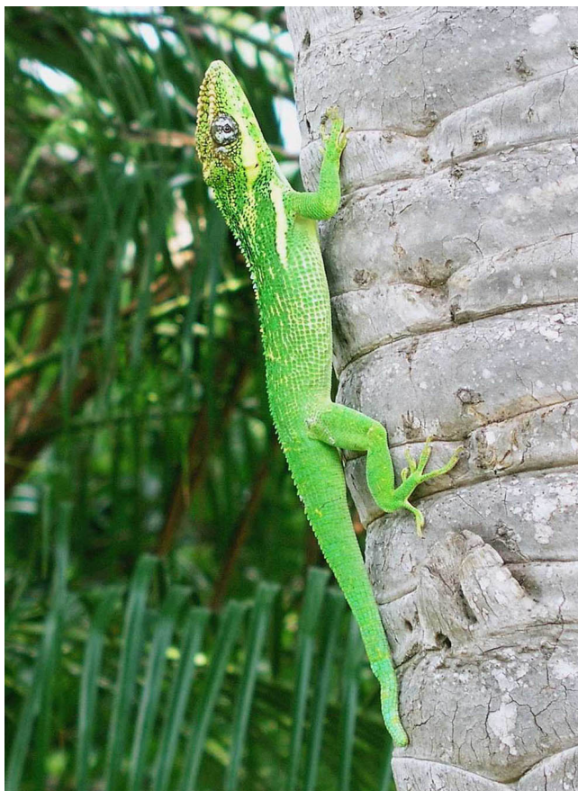
Figure 9. Adult knight anole ( Anolis equestris ).

Damage caused by iguanas includes eating valuable landscape plants, shrubs, and trees, eating orchids and many other flowers, eating dooryard fruit like berries, figs, mangos, tomatoes, bananas, lychees, etc. Iguanas do not eat citrus. Burrows that they dig undermine sidewalks, seawalls, and foundations. Burrows of iguanas next to seawalls allow erosion and eventual collapse of those seawalls. Droppings of iguanas litter areas where they bask. This is unsightly, causes odor complaints, and is a possible source of salmonella bacteria, a common cause of food poisoning. Adult iguanas are large powerful animals that can bite, cause severe scratch wounds with their extremely sharp claws, and deliver a painful slap with their powerful tail. Iguanas normally avoid people but will defend themselves against pets and people that try to catch them or corner them.