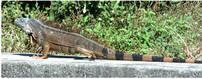
Figure 2. Adult green iguana ( Iguana iguana) on a seawall.