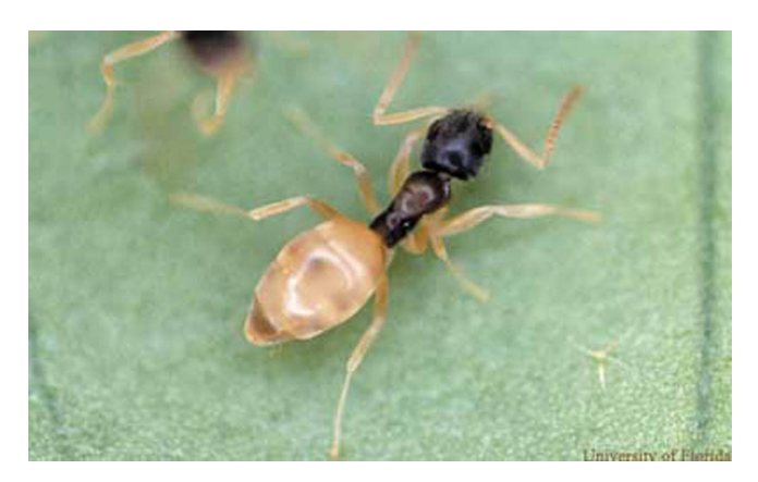
Figure 1. Worker of the ghost ant, Tapinoma melanocephalum (Fabricius).