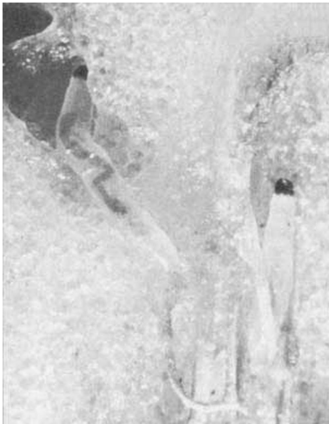
Figure 1. Darkwinged fungus gnat, Bradysia coprophila (Linter), larvae feeding on cactus tissues. Credits: Division of Plant Industry

Larvae: The larvae are white, slender, legless, with a black head and smooth semi-transparent skin revealing digestive tract contents, length when fully grown 1/4 inch (6 mm). There is nothing else similar in the greenhouse.