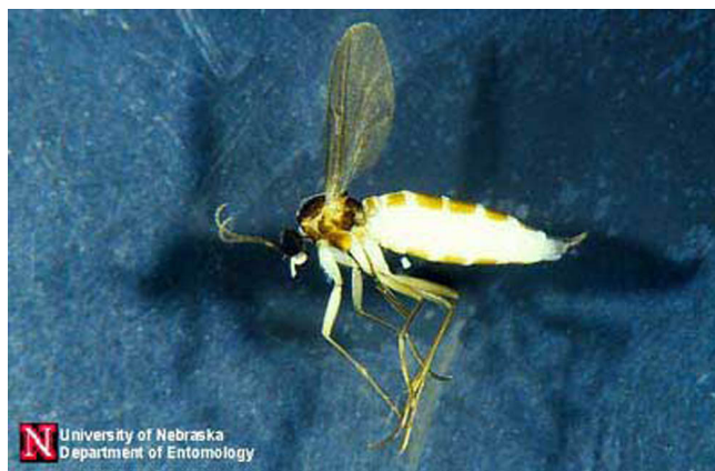
Figure 4. Adult darkwinged fungus gnat.

flight, which usually consists of short darting or hovering movements over a small area.