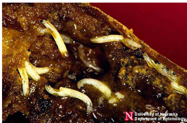
Figure 2. Darkwinged fungus gnat larvae feeding in rotten potato.

Valley (1975) described behavior of adult sciarids near infested potted plants, soil, etc. He wrote that when disturbed, the gnats run rapidly or take