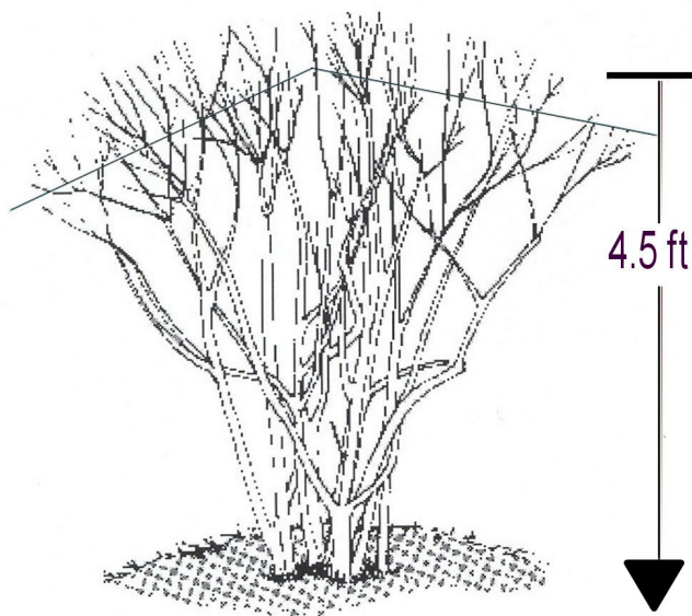
Figure 4. Southern highbush blueberry plants are topped in the summer soon after harvest to stimulate strong vegetative growth during the remainder of the growing season.