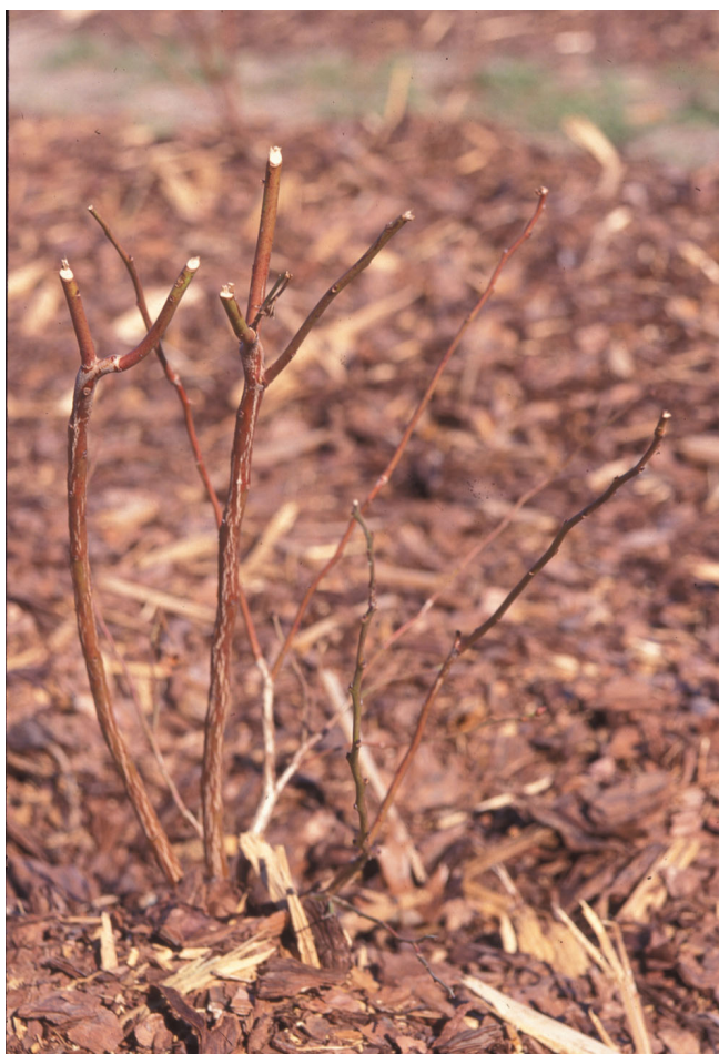
Figure 1. A young blueberry plant pruned back to about 50% to 65% of its original size at transplanting from the nursery to the field.

Dormant pruning. Annual dormant pruning of highbush blueberry plants is needed to prevent overbearing, maintain plant vigor, and enhance fruit quality and earliness. Dormant pruning should begin