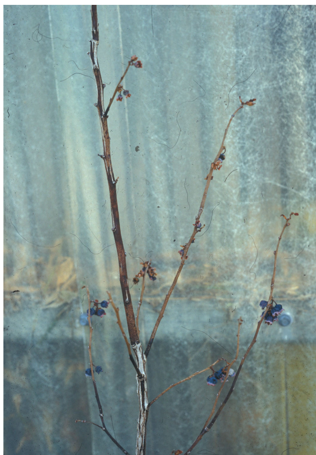
Figure 3. Young blueberry plant with blueberry stem blight caused by stress associated with fruit set without leaves.

Summer topping. In Florida, summer topping is used to stimulate vegetative growth of bearing southern highbush and should be done soon after harvest, usually during June (Fig. 4). Plants should be fertilized the week before pruning so they will