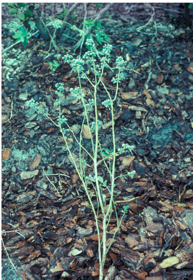
Figure 2. Young 'Misty' plant with heavy fruit set and few leaves with probably die from blueberry stem blight before the end of the growing season.

and lose their vigor and productivity. When blueberry plants are between 5 and 6 years old, removal of some of the older canes should begin. This will stimulate the development of new, productive, canes. Each year, thinning cuts are used to remove approximately 25% of the oldest canes by cutting them back to strong laterals or close to the ground. Regular cane renewal pruning allows for constant long-term productivity with bushes that contain a mixture of canes of different ages. As plants age, a combination of thinning cuts and heading back cuts will be needed to meet the objectives of cane renewal, fruit load adjustment, maintenance of vigor, and proper plant size and shape.