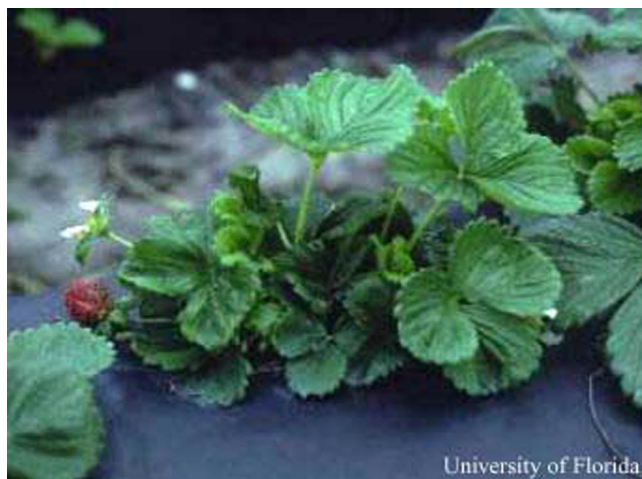
Figure 3. A strawberry plant damaged by cyclamen mite, Phytonemus pallidus (Banks). Leaf petioles are short, blades are small, thickened and wrinkled, and total growth is stunted.

Pest of many ornamental flowers and shrubs such as Cyclamen, African violet, begonia, gerbera, ivy, chrysanthemums, geranium, fuchsia, larkspur, petunia, snapdragon, and other greenhouse grown plants. If the humidity is high, field grown strawberries also may be infested.