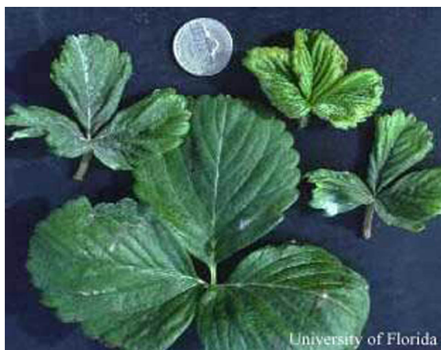
Figure 6. One normal, large undamaged strawberry leaf compared with three leaves damaged by cyclamen mite, Phytonemus pallidus (Banks).

Look for distorted, dwarfed, irregular folding of leaves, thickening of leaves or shortening of petioles.