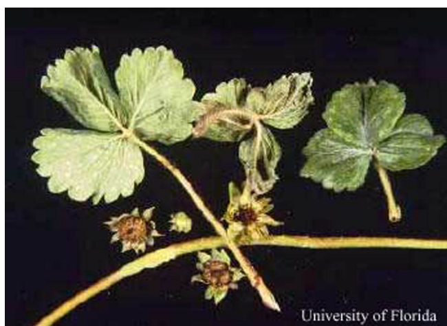
Figure 4. Strawberry leaves and flowers damaged by cyclamen mite, Phytonemus pallidus (Banks). The flowers are dead.

Infested plants may have a streaked and/or blotched appearance, distorted leaves with small distorted flowers, fewer flowers than normal or complete abortion of flower buds. Infested strawberry plants produce a roughened, wrinkled upper leaf surface, irregular folding and fluting of the leaf margins, and veins that bulge upward like blisters. Plants with mild injuries assume a dense appearance because petioles fail to elongate. A heavy infestation will kill African violets and cyclamens by dwarfing the leaves at the crown, and some leaves fail to open.