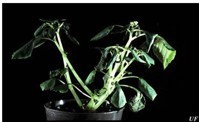
Figure 5. Damage to Impatiens sp. by the cyclamen mite, Steneotarsonemus pallidus (Banks).

Unless African violets are examined carefully periodically, the cyclamen mite can be overlooked easily and cause damage by sucking out plant juices, causing cells to collapse and providing an entry for