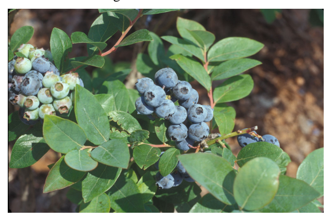
Figure 2. 'Jewel' blueberry.

Jewel (Fig. 2) is a patented release from the University of Florida breeding program with a moderately low chilling requirement, very early ripening, and high berry quality. In Gainesville, Jewel typically flowers about February 16 and begins ripening about 5 days earlier than Sharpblue. The average date when commercial harvest for Jewel begins in Gainesville is about April 15 and harvest is normally finished by May 12. Jewel produces a large number of flower buds but leafs well in the spring. Vigor is about equal to Sharpblue but Jewel is shorter and more spreading than Sharpblue. Berry quality is excellent but tends to be tart until fully ripe. Berry size is about equal to Sharpblue, but firmness and scar are much better than Sharpblue. Jewel may be considered for trial from Ocala north into SE Georgia. In central Florida, Jewel has looked good in some fields, producing large early berries but these plantings are still young. Jewel is moderately susceptible to Phytophthora root rot. Overhead irrigation is recommended for freeze protection wherever Jewel is grown.