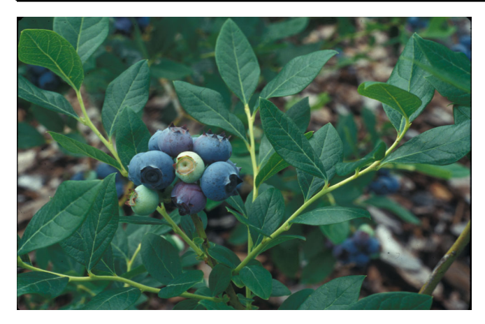
Figure 6. 'Star' blueberry.

averages about April 15, and 50% of the berries are normally ripe by April 28. Windsor berries are very large. Berries from the first half of the harvest average about 2.4 grams on young vigorous plants. The berries are about the same color as those of Sharpblue and Star. It has good firmness and flavor. Although Windsor grows and fruits well, it has lost favor among growers because of the deep picking scar which complicates packing and reduces post-harvest life.