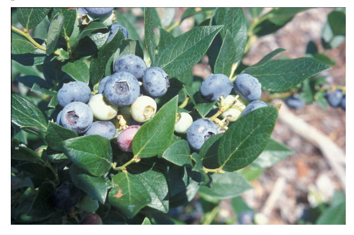
Figure 7. 'Windsor' blueberry.

averages about April 15, and 50% of the berries are normally ripe by April 28. Windsor berries are very large. Berries from the first half of the harvest average about 2.4 grams on young vigorous plants. The berries are about the same color as those of Sharpblue and Star. It has good firmness and flavor. Although Windsor grows and fruits well, it has lost favor among growers because of the deep picking scar which complicates packing and reduces post-harvest life.