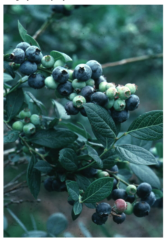
Figure 4. 'Misty' blueberry.

Heavy winter pruning and use of Dormex have partially alleviated the problems associated with overbearing and poor foliation. Misty is gradually being replaced by superior varieties.