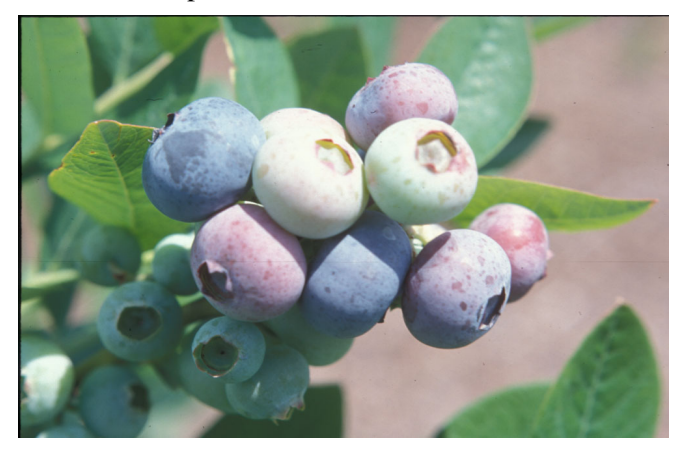
Figure 3. 'Millennia' blueberry.

Millennia (Fig. 3) was released as a patented variety by the University of Florida breeding program in 2001. It is one of the more widely planted varieties in north-central Florida. Millennia is medium to high in vigor and has a spreading, rather than an upright, growth habit. It produces a heavy load of flower buds in the fall, and young plants should be winter pruned the first 2 years to prevent over-fruiting and to enhance early leafing. Older plants may require either Dormex application or winter pruning to increase leafing and/or reduce the flower load. The average date on which Millennia reaches 50% open flower is about Feb. 16 in Alachua County. In Alachua County, first commercial harvest on Millennia (10% of fruit ripe) averages about April 15, and the first half of the berries are normally ripe by April 28. The berry of Millennia is large to very large on well-leafed bushes that are not overloaded. Millennia berries are very firm, equal to Star. The picking scar is good to excellent. The flavor is good, although it can be somewhat bland on poorly-leafed or overloaded plants.