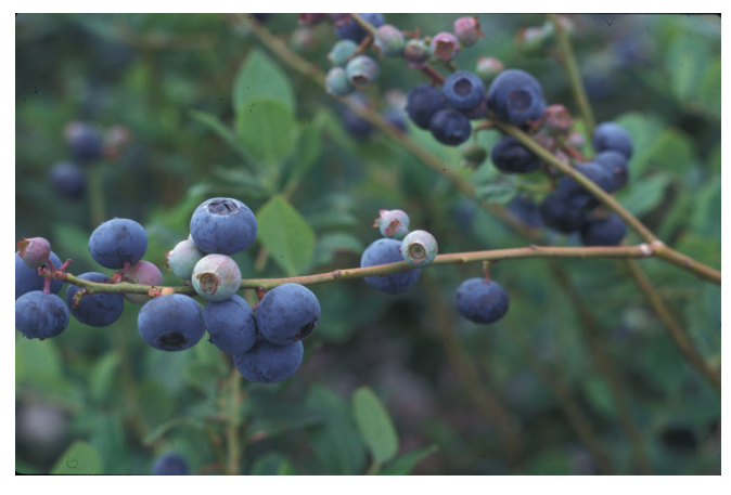
Figure 5. 'Sapphire' blueberry.

Sapphire (Fig. 5) is a low-chill southern highbush blueberry that is recommended mainly as an early-season variety in areas south of I-4 where blueberries can be commercially grown. In Alachua County, Sapphire reaches 50% open flower about February 18. First commercial harvest of Sapphire in Alachua County averages about April 16 and harvest is complete before May 15. Ripening is more concentrated on Sapphire than on Sharpblue, Fruit color and size are comparable to Sharpblue and Misty. The picking scar is dry and fruit are firm. Sapphire is not as vigorous as Sharpblue and tends to set large numbers of flower buds which may require thinning for adequate vegetative growth. The plants may be slow to establish during the first 2 to 3 years after planting. Because of its low vigor, Sapphire should only be planted on good blueberry land or in pine bark beds. Overhead irrigation is recommended for freeze protection wherever Sapphire is grown. From Ocala north, Sapphire has been replaced by varieties with greater vigor, such as Star, Millennia, Jewel, and Emerald.