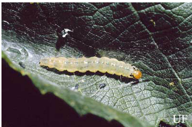
Figure 1. Larva of the grape leafroller, Desmia funeralis (Hübner).

Adults have a wing expansion varying from about 4/5 inch to nearly 1 1/4 inches. The color of the wings is very dark brown, almost black, with a silvery or bluish iridescence. The forewings in both sexes have two nearly oval white spots. The hind wings of the male have one white bar which in the female is partly or completely divided into two spots. Both sexes have various amounts of white on the fringes of the wings and parts of the head, body, and legs. The antennae in the male appear thickened and notched near the middle, while in the female they are uniform and threadlike. Adults of other species of Desmia and certain other similar species in Florida have the white spots of the wings much more linear or are obviously different in number of spots or some other characteristic.