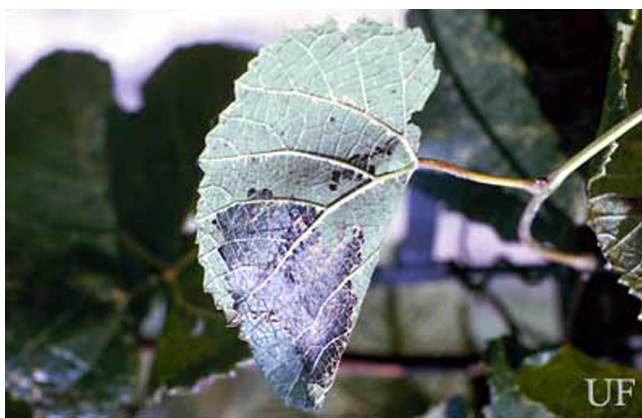
Figure 3. Damage to bunch grape foliage caused by the grape leafroller, Desmia funeralis (Hübner).

Wild and cultivated grapes, Vitis spp., are the principal hosts of the grape leafroller. Two varieties of redbud, Cercis canadensis and C. chinensis ; Virginia creeper, Parthenocissus quinquefolia ; and Oenothera have been reported as occasional hosts.