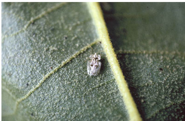
Figure 2. Closeup of adult sycamore lace bug, Corythucha ciliata (Say).

The sycamore lace bug is the only lace bug listed as feeding on P. occidentalis according to the world host list for lace bugs (Drake and Ruhoff 1965). Adults are whitish in color and about 3 mm in length. For practical purposes, the association with the host plant should be diagnostic for this species.