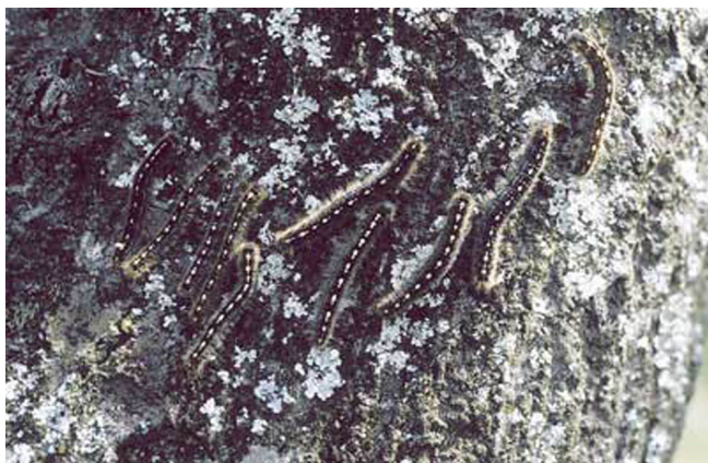
Figure 6. Gregarious larvae of the forest tent caterpillar, Malacosoma disstria Hübner.

communication). Within egg masses, pharate larvae develop by fall and diapause through winter until emerging the following spring to begin the cycle again.