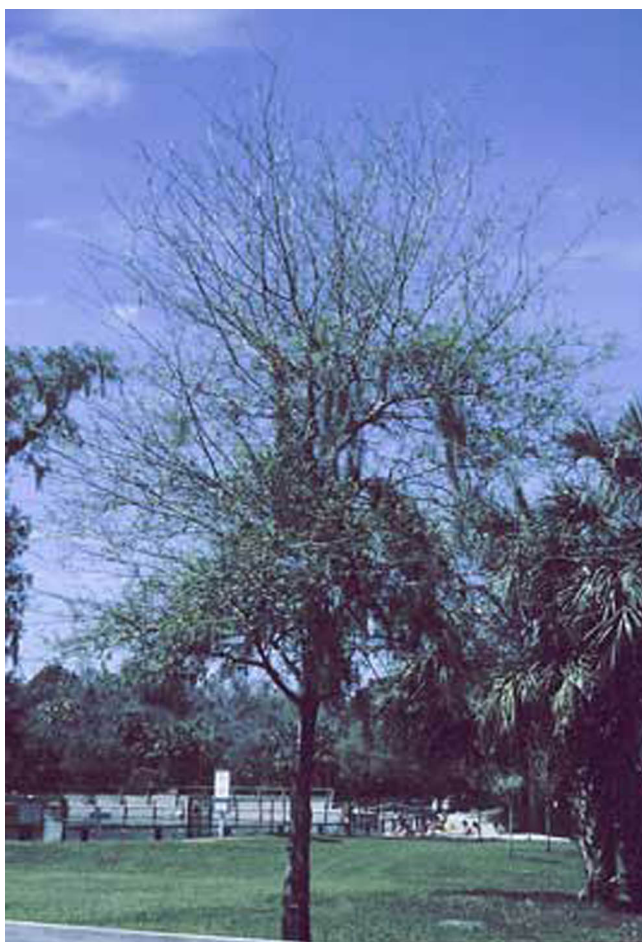
Figure 8. Tree defoliated by larvae of the forest tent caterpillar, Malacosoma disstria Hübner.

including conifers. For example, during the recent outbreak in West Central Florida, forest tent caterpillars were observed feeding on virtually all sorts of woody plant foliage, some of which included citrus ( Citrus sp.), pine ( Pinus sp.), loquat ( Eriobotrya japonica Lindl.), azalea ( Rhododendron sp.), and rose ( Rosa spp.). If otherwise healthy, the common host trees will typically re-foliate within a few weeks, after the springtime defoliation.