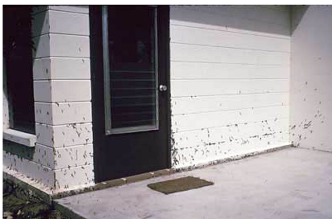
Figure 7. Larvae of the forest tent caterpillar, Malacosoma disstria Hübner, seeking sites for pupation on the side of a structure.