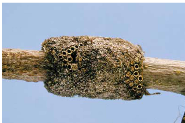
Figure 5. Typical egg mass of the forest tent caterpillar, Malacosoma disstria Hübner.