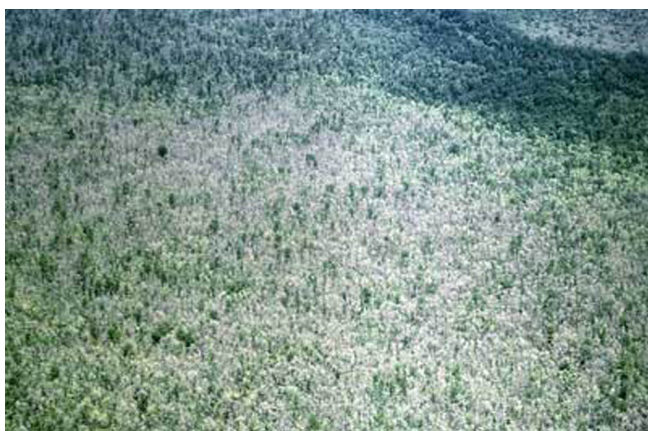
Figure 1. Forest showing an outbreak of the forest tent caterpillar, Malacosoma disstria Hübner, with resulting defoliation.

30,000 ac), causing very heavy defoliation of turkey oaks ( Quercus laevis Walter) and a "great problem" due to the abundance of crawling caterpillars. Other large forest tent caterpillar outbreaks in Florida have been recorded in Pasco County (1967; ca 2,000 affected acres; primary host turkey oak), Citrus and Hernando counties (1969; ca 10,000 ac of the Withlacoochee State Forest; turkey oak), Hernando, Marion and Pasco counties (late March to April 1977; ca 25,000 acres; turkey oak), and Hernando, Lafayette, Levy and Pasco counties (1988; Quercus spp.) (Florida Department of Agriculture and Consumer Services, Division of Plant Industry (FDACS-DPI) and Division of Forestry (DOF) records).