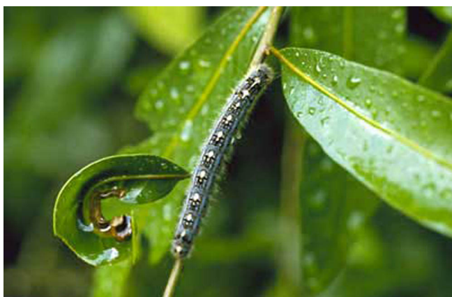
Figure 4. Light color phase larva of the forest tent caterpillar, Malacosoma disstria Hübner.