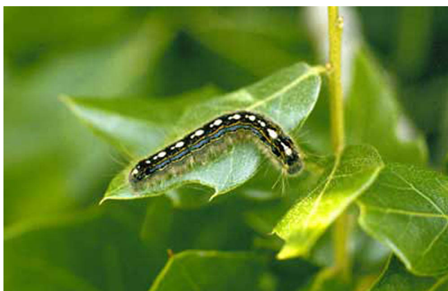
Figure 3. Dark color phase larva of the forest tent caterpillar, Malacosoma disstria Hübner.