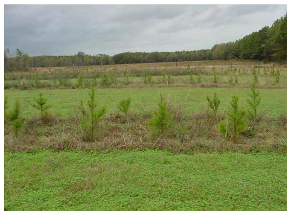
Figure 2. Loblolly pine planted in 4x8x40 ft spacing in bahiagrass – crimson clover pasture after one growing season in the field (George Owens farm near Chipley, FL, December 2001).

Other tree arrangements in silvopastures are also possible. Trees can be planted in single wide-spaced rows, sets of multiple rows with wide alleys between the sets, or in clusters. In any tree arrangement, open areas between trees allow for forage production. Planting trees in rows facilitates access for future forage and silvicultural operations (Sharrow, 1999). Therefore, planting trees in rows is preferred over random tree placement or planting tree clusters. Generally, wide spacing between single rows, or wide alleys between sets of multiple rows supports higher levels of forage production than closely spaced rows. However, too much open pasture space also means less wood production on a per acre basis. The trade-offs between timber and forage production are well illustrated by comparing yields of both commodities in 4x8x40 and 2x8x88 ft spacings. The 4x8x40 ft tree pattern produced twice as much wood as the 2x8x88 tree spacing, whereas the opposite was true for forage production (Table 1).