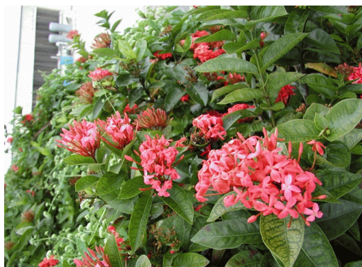
Figure 1. Ixora .

Ixora , like other acid-loving plants such as hibiscus, gardenia, citrus, and Allamanda , can be an attractive landscape plant, but there are a few requirements you need to know to keep Ixora healthy and flowering in your yard. All acid-loving plants will require more fertilization management than plants that are adapted to growing in alkaline soils. Mostly this involves being aware of the pH (or acidity) of the soil you are planting in. A pH of around 5 is good for Ixora ; this pH is slightly lower than for most landscape plants. Avoid planting Ixora or any acid-loving plant close to your concrete foundation, and screen soil in planting areas for any concrete