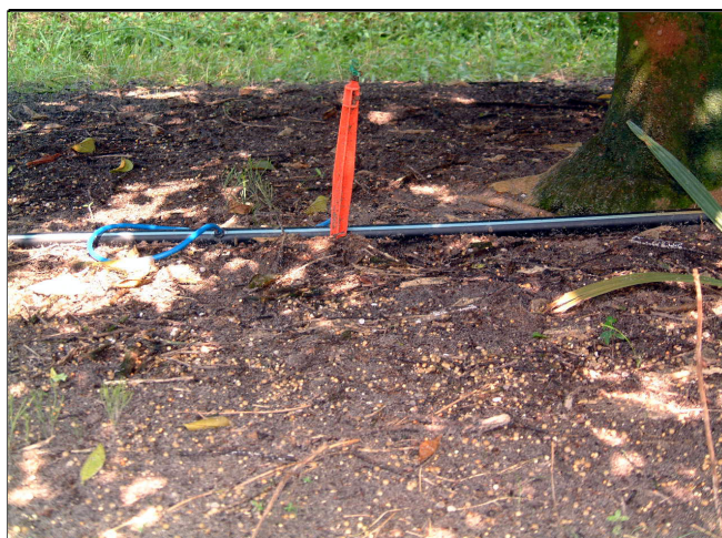
Figure 2. Fertilizer remains under the tree canopy following several heavy rain events during the first two months after application.

Yield response to water-soluble N fertilizer was described by a gently-sloping curve that reached its maximum at 77 pounds solids/tree (Fig. 3). Description of the N rate response for CRFs was limited because the resin and Poly-S coated sources were applied at only two rates and the mixture was applied at only one rate. Still, the increased N fertilizer efficiency provided by the controlled-release sources was evident by the sharp increase in yield as N rate increased from 45 to 90 lbs/acre (Fig. 3). It was apparent that the citrus trees responded more strongly to increasing rates of CRF compared with the water-soluble source.