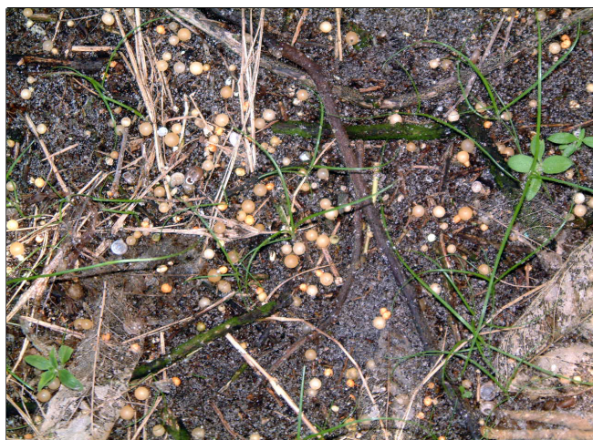
Figure 1. Fertilizer shown under the tree canopy following mechanical application.

together and expressed production as “5-year cumulative pounds solids per tree.”