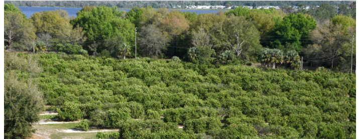
Figure 1. A University of Florida orange grove in Lake Alfred, Florida.

Florida is well known for its citrus industry, which is valued at over 8 billion dollars, and is one of the top citrus-producing states in the United States. Over 90% of Florida’s citrus crop is processed (squeezed) for juice. Florida orange juice is shipped around the world. The most common citrus fruit grown in Florida is the Valencia orange, but grapefruit, lemons, limes, and tangerines are also grown in Florida.