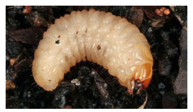
Figure 1. Diaprepes larva

Diaprepes weevils are a type of beetle that feeds on citrus trees and some decorative plants. These beetles came to Florida in the 1960s from the Caribbean. The larvae (babies/kids) feed underground on roots. Larvae are white and up to one inch long, and they have no legs. As larvae, their main job is to eat so they can develop into adults and leave their underground home.