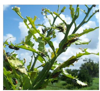
Figure 3. Feeding damage by adult larva Diaprepes .

Adult diaprepes weevils feed on plant leaves. On its own, one beetle will only eat a small part of the leaf, but if a lot of adults feed on the same plant, they can cause a lot of damage. This damage can be expensive to prevent and control.