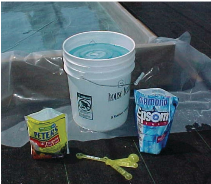
Figure 2. Nutrients needed for floating garden.

a rate range of 1-2 level teaspoons of fertilizer for each gallon of water used in the water garden. In addition, add Epsom Salts (magnesium sulfate) at a rate range of one-half to one level teaspoon for each gallon of water. Use a soft broom to mix the water & fertilizer in the garden or premix all fertilizer in a bucket before adding to water garden (Figure 2). Note this fertilizer is built for water sources where calcium is abundant in the water supply. Much of Florida's water is high enough to meet the calcium needs of most plants. However, if your water supply is low in calcium, you will need to add a calcium source from a hydroponic supplier or use a standard hydroponic fertilizer with calcium included.