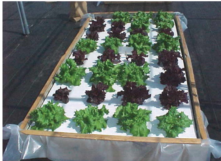
Figure 6. Healthy lettuce being grown in a standard 4x8 ft floating garden.

There are fewer crop options for the warm season, however, basil, Swiss chard, cucumber, watercress, and some cut-flowers, like Zinnia and sunflowers have done well. Growing with floating systems does not override the normal challenges of gardening in the warm season in Florida.