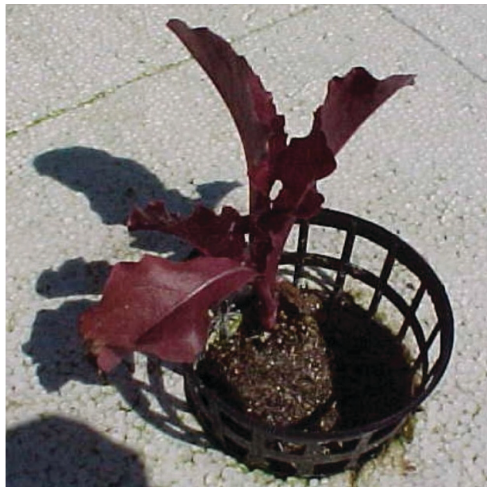
Figure 3. Lettuce transplant in net pot.