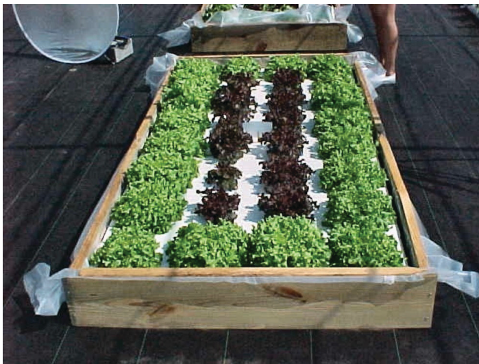
Figure 1. Lettuce in floating garden system.

The Aztecs amazed the Spanish conquistadors with their floating gardens, and now 500 years later you can impress your friends and neighbors with yours. A floating hydroponic garden is easy to build and can provide a tremendous amount of nutritious vegetables for home use, and best of all, hydroponic systems avoid many pest problems commonly associated with the soil. This simple guide will show you how to build your own floating hydroponic garden using material locally available at a cost of about $50.00 (Figure 1).