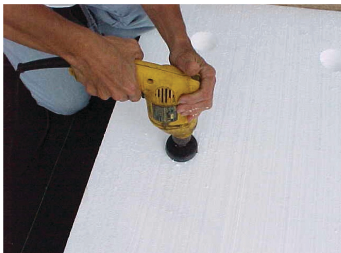
Figure 4. Drilling holes in styrofoam for transplants.