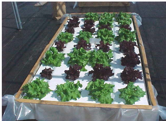
Figure 6. Healthy lettuce being grown in a standard 4x8 ft floating garden.

with floating systems does not override the normal challenges of gardening in the warm season in Florida.