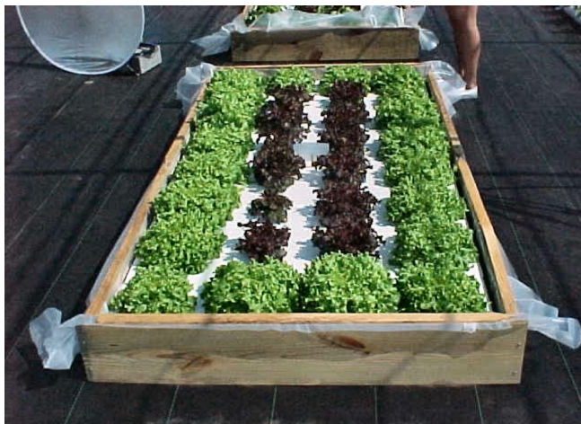
Figure 1. Lettuce in floating garden system.

The Aztecs and Incas amazed the Spanish conquistadors with their floating gardens, and now 500 years later you can impress your friends and neighbors with yours. A floating hydroponic garden is easy to build and can provide a tremendous amount of nutritious vegetables for home use, and best of all, hydroponic systems avoid pest problems commonly associated with the soil. This simple guide will show you how to build your own floating hydroponic garden using material locally available at a cost of about $40.00 (Figure 1).