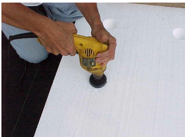
Figure 4. Drilling holes in styrofoam for transplants.