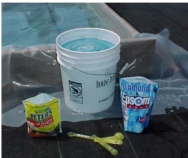
Figure 2. Nutrients needed for floating garden.