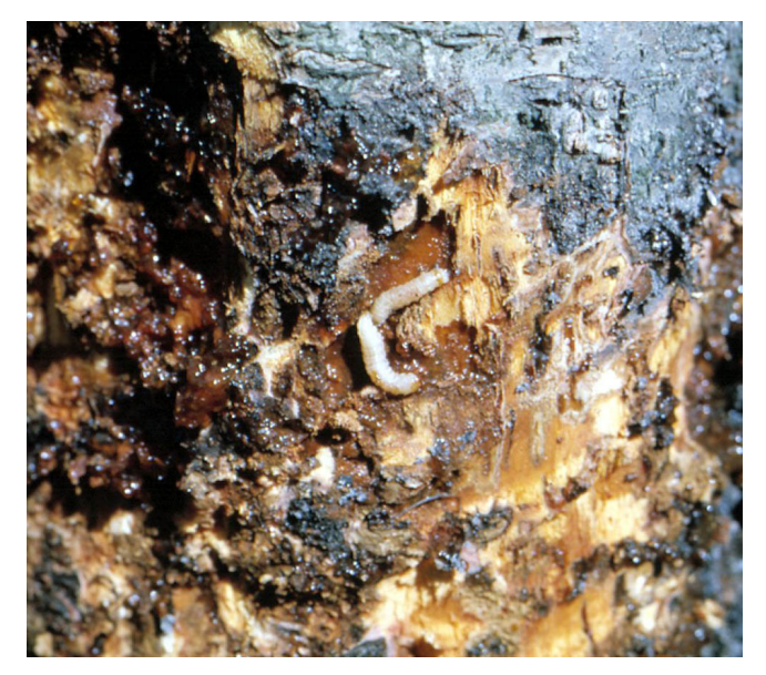
Figure 2. Damage and larval feeding on trunk of peach tree by peachtree borer larvae.

Infestations by borers are closely associated with diseased, damaged or otherwise weakened trees. Therefore, it is important to maintain thrifty trees and