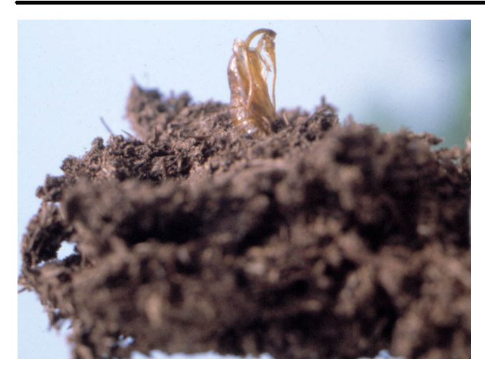
Figure 4. Peachtree borer pupal case protruded from the tree indicates borer emergence.