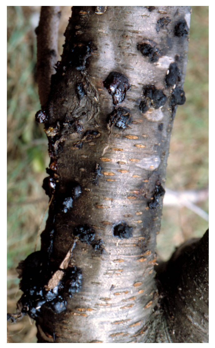
Figure 6. Gummosis caused by lesser peachtree borer on lower limbs.

Several chemicals are registered for use against borers (See Insect Management on Peaches http://edis.ifas.ufl.edu/IG075 for approved, registered compounds). These chemicals must be applied using