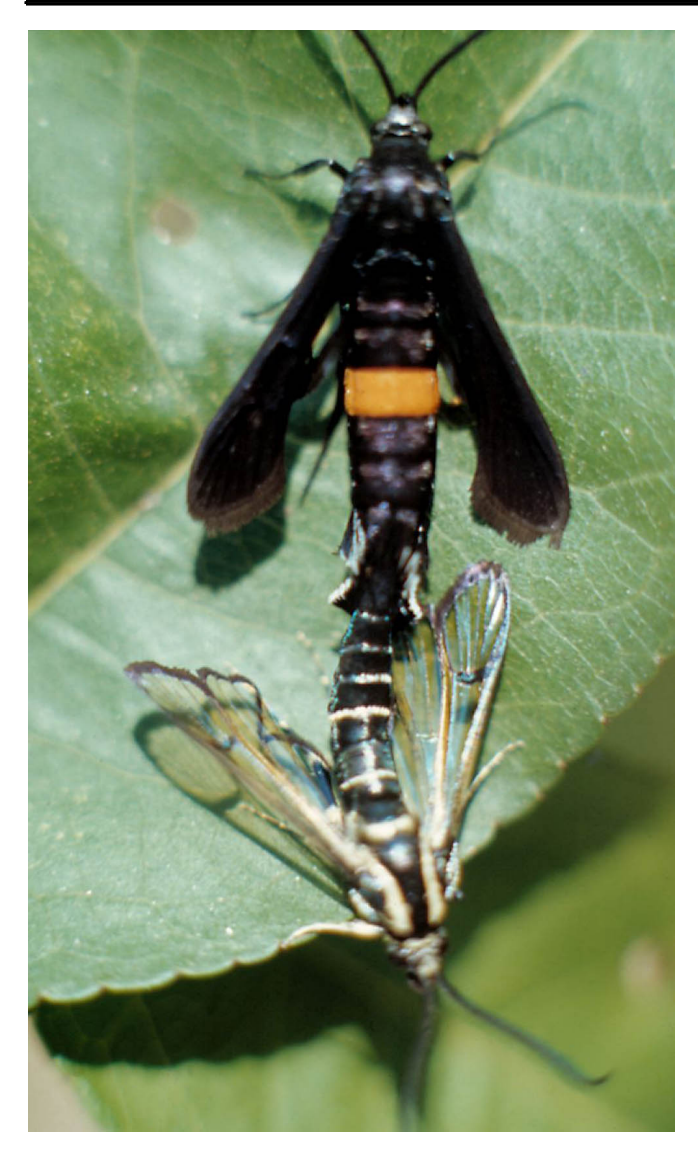
Figure 1. Adult female (top) and male (bottom) of the peachtree borer.

per year. Peak populations in Florida occur in March and April and are stable through November.