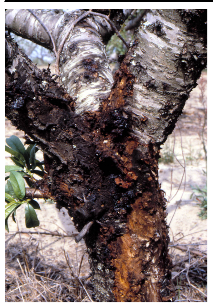
Figure 7. Damage - gummosis and sawdust - caused by feeding of lesser peachtree borer.