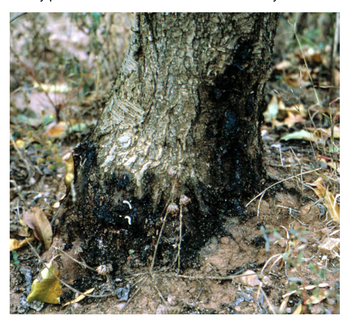
Figure 3. Gummosis at ground level of peach tree infested by the peachtree borer.

to avoid unnecessary damage to trees from orchard or homeowner machinery. A weed-free herbicide strip under trees precludes the need of moving machinery close to tree trunks. However, prior damage to trees is not a prerequisite for borer infestations. It is necessary for both homeowners and commercial growers to monitor trees for signs of infestation. This can be done by looking for gummosis and sawdust produced by the larvae of for the pupal cases. Often these signs - especially pupal cases - mean considerable damage has occurred. An alternate method is to use trunk cover sprays at scheduled times during the season, or