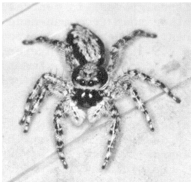
Figure 2. Female gray wall jumper, Menemerus bivittatus (Dufour).