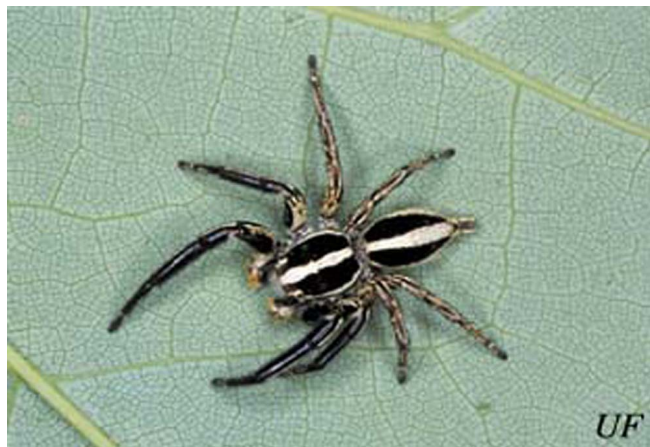
Figure 3. Male pantropical jumper, Plexippus paykulli (Audouin).