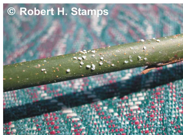
Figure 10. Fern scale on Aspidistra petiole.

Control - Oils should not generally be used on Aspidistra leaves being grown for cut foliage use because they can penetrate into the leaves and cause a "water-soaked" mottling that is unacceptable to florists (Figure 11). Systemic insecticides are preferred because it is difficult to penetrate the waxy