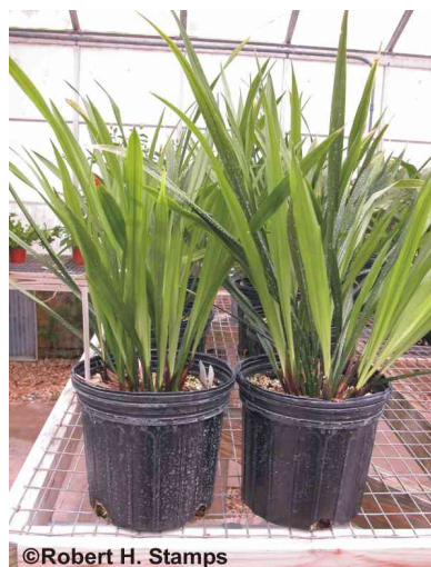
Figure 4. A. caespitosa 'Jade Ribbons'.

Another Aspidistra just becoming available is A. caespitosa . The cultivar 'Jade Ribbons' has narrow (1/2 inch [1.2 cm]) leaves that may reach 24 inches [0.6 m] in length (Figure 4). Like other Aspidistra , this plant seems to be fairly slow growing.