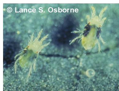
Figure 12. Two-spotted spider mites.

Symptoms - These mites are very small, have dark areas on each side of the body, and typically are found on the undersides of leaves (Figure 12). When present, they can be detected by beating leaves against a light-colored surface and looking for these eight-legged creatures running across the surface.