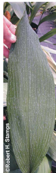
Figure 1. Aspidistra elatior leaf.

The most common species is Aspidistra elatior , the cast-iron or bar-room plant of the Victorian era (Figure 1). It is renowned for its durability and ability to survive under adverse conditions: low light, high heat, poor soil, and drought. The specific epithet