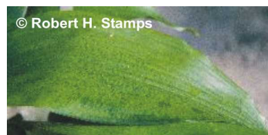
Figure 11. Oils can penetrate Aspidistra leaves and cause unsightly mottling.

outer coating of the scale. Few materials are specifically labeled for use on Aspidistra . See http://edis.ifas.ufl.edu/IG012 for a listing of products available for controlling scales. Prior to widespread use, test new products for crop safety by making multiple applications to a small block of representative plants and then checking them for damage.