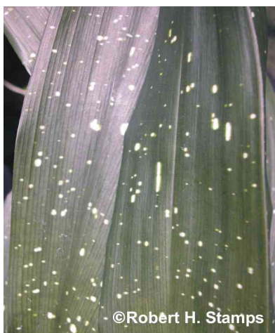
Figure 3. A. lurida 'Ginga/Starry Night'.

Less readily available but becoming increasingly common is A. lurida 'Ginga' (Figure 3). 'Ginga' may also be sold as 'Starry Night' and has shiny green leaves covered with cream- to white-colored streaks and spots. 'Ginga' leaves can grow as long as those of A. elatior but are narrower, usually less than 3 inches [8 cm] wide. The leaves of the cultivar 'Milky Way' ('Minor') are also covered with ivory- to white-colored dots and dashes like 'Ginga/Starry Night'; however, the blades are shorter (less than 2 feet [0.6 m]), narrower (3 inches [8 cm]) and are not