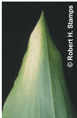
Figure 13. Mite feeding can lead to severe damage to Aspidistra leaves.

Unless actively scouted for, two-spotted spider mites are often not detected until plants are severely infested. Mite feeding causes foliage to become speckled, may induce yellowing and ultimately can lead to leaf tip dieback (Figure 13).