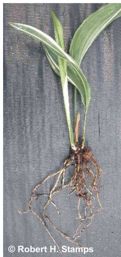
Figure 8. Aspidistra are typically propagated by dividing the rhizome.

Propagation: Aspidistra are most commonly propagated by division of the rhizome (underground stem) (Figure 8). This method of propagation helps assure that propagules will have the characteristics of the original plant. Plants can be started from each underground node. Some Aspidistra are also started from seed but seed is not readily available.