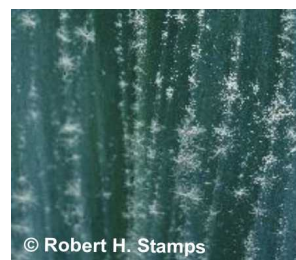
Figure 15. While not harmful, pollen can be an unsightly problem on Aspidistra grown under trees.

Pollen: When Aspidistra are grown under trees the leaves may become coated with pollen (Figure 15). This is also a cosmetic problem and not a disease. As with lichens, pollen can be wiped off the leaves.