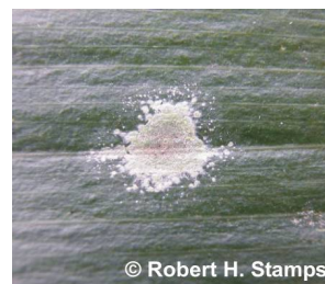
Figure 14. Lichens can develop on old Aspidistra leaves that were not harvested in their prime.

Lichens: When Aspidistra are grown under heavy shade the leaves may become coated with lichens (Figure 14). Lichens are plants composed of algae and fungi living together symbiotically (the association is beneficial to both organisms). This is a cosmetic problem and is not a disease. Lichens are slow growing and their presence on Aspidistra leaves is an indication that the leaves are quite old. Even though the lichens can be wiped off, the leaves probably should not be harvested since they are well past their prime.