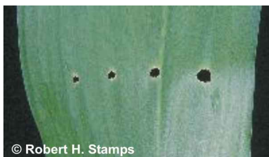
Figure 9. Typical damage caused when a caterpillar feeds on an emerging leaf while it is still curled up.

Symptoms - Worm-like creatures crawling on the leaves. Rows of holes in lines perpendicular to the length of the leaf (Figure 9).