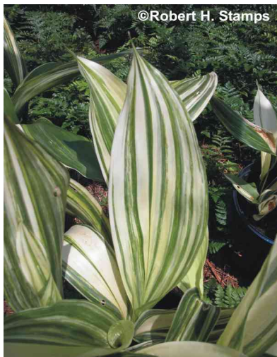
Figure 2. Aspidistra elatior 'Okame'.

is highly sought after but, unfortunately, is slower and harder to grow than the green form. Its leaves tend to be highly variable even on the same plant and some will revert to all green over time. If green leaves are not removed, they will out-compete the variegated ones and take over.