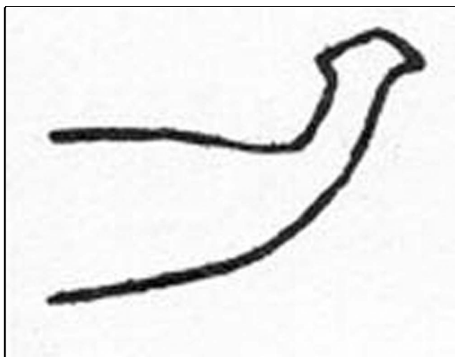
Figure 2. Male aedeagus.

composed of the egg, the larva, two nymphal stages (protonymph and deutonymph) and the adult. The length of time from egg to adult varies greatly depending on temperature. Under optimum conditions (approximately 80 degrees F), spider mites complete their development in five to twenty days. There are many overlapping generations per