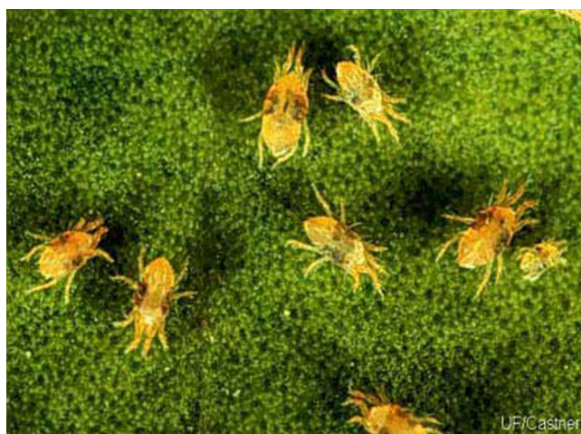
Figure 3. Twospotted spider mites, Tetranychus urticae Koch.

composed of the egg, the larva, two nymphal stages (protonymph and deutonymph) and the adult. The length of time from egg to adult varies greatly depending on temperature. Under optimum conditions (approximately 80 degrees F), spider mites complete their development in five to twenty days. There are many overlapping generations per