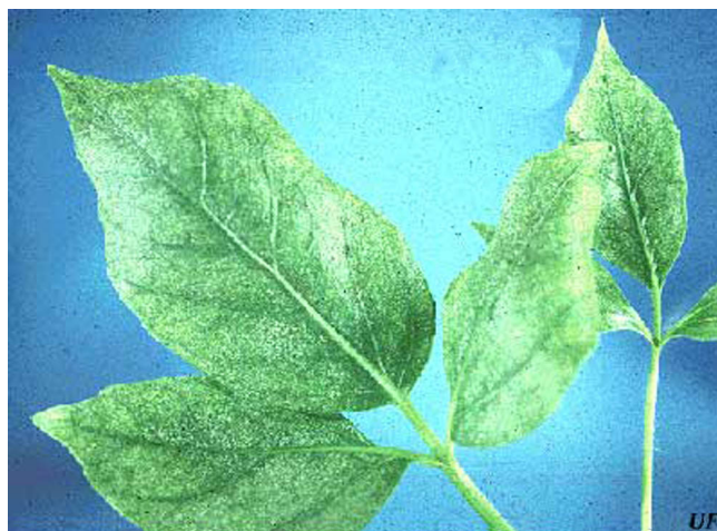
Figure 5. Damage caused by the twospotted spider mite, Tetranychus urticae Koch.

Predators are very important in regulating spider mite populations and should be protected whenever