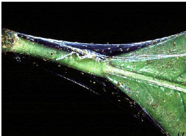
Figure 4. Webbing produced by twospotted spider mites, Tetranychus urticae Koch.

All mites have needle-like piercing-sucking mouthparts. Spider mites feed by penetrating the plant tissue with their mouthparts and are found primarily on the underside of the leaf. All spider mites spin fine strands of webbing on the host plant--hence their name.