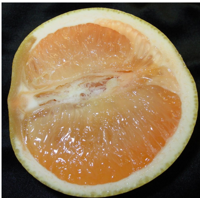
Figure 2. External symptoms of blossom-end clearing on grapefruit (left) compared to an un-injured fruit (right). View is from the bottom of the fruit.