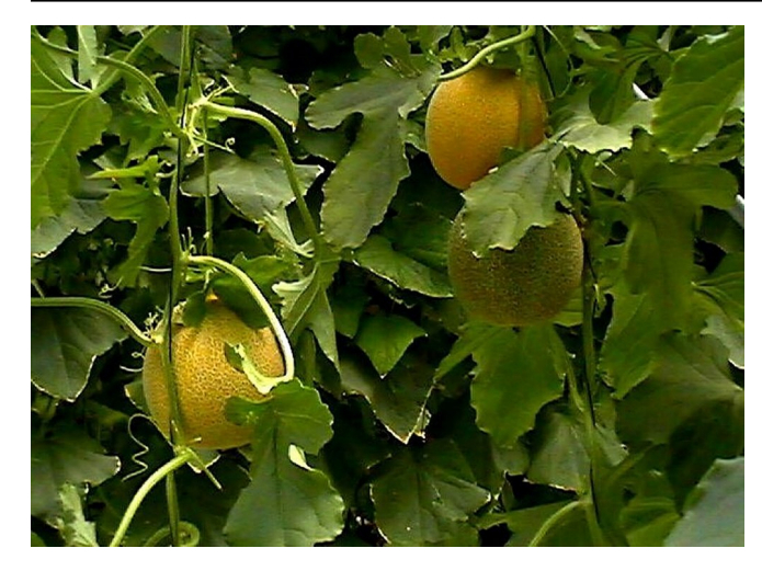
Figure 2. Greenhouse production of Galia melons.

trial basis before using them on a commercial scale. Transplants can be produced in a peat:perlite mix and transplanted after 3-4 weeks. In the Gainesville, Fla. area, the Fall crop should be planted before the first week of August and the Spring crop should be planted mid to late January. (Normal daily mean temperature in Gainesville, FL is 54° F in January and 80° F in August, Normal Daily Mean Temperature Web site). In other regions, planting dates should reflect local temperatures.