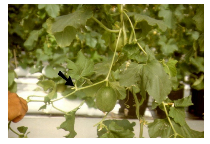
Figure 4. Lateral with developing fruit. Arrow indicates where lateral should be pruned.

The leaf may be left at the pruned node or removed. Fruit set at the first node on a lateral are often higher quality than those set on subsequent nodes. Therefore, if fruit does not set at the first or second node on a lateral due to poor pollination, temperature imbalances, or inadequate early pruning, it is preferable to remove the entire lateral to encourage fruiting at higher laterals.