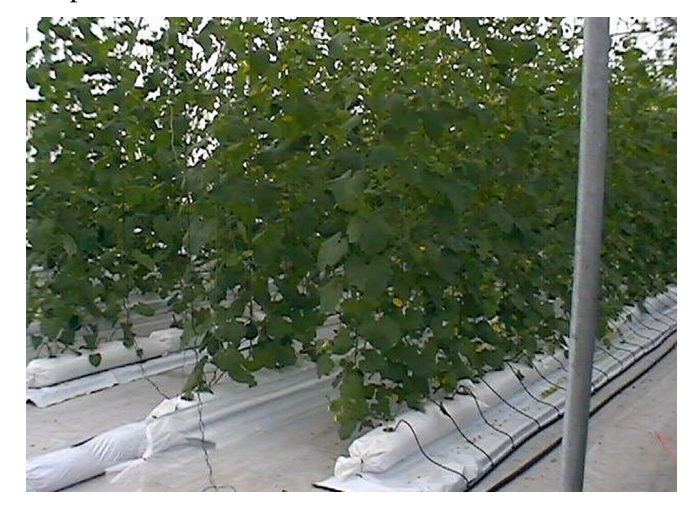
Figure 3. Production of Galia melons in perlite-filled bags.

trial basis before using them on a commercial scale. Transplants can be produced in a peat:perlite mix and transplanted after 3-4 weeks. In the Gainesville, Fla. area, the Fall crop should be planted before the first week of August and the Spring crop should be planted mid to late January. (Normal daily mean temperature in Gainesville, FL is 54° F in January and 80° F in August, Normal Daily Mean Temperature Web site). In other regions, planting dates should reflect local temperatures.