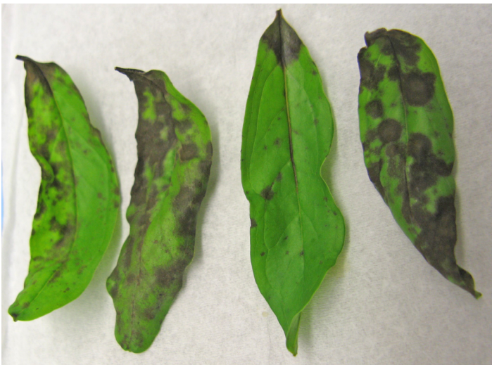
Figure 3. Anthracnose leaf spot of pomegranate caused by Colletotrichum spp.