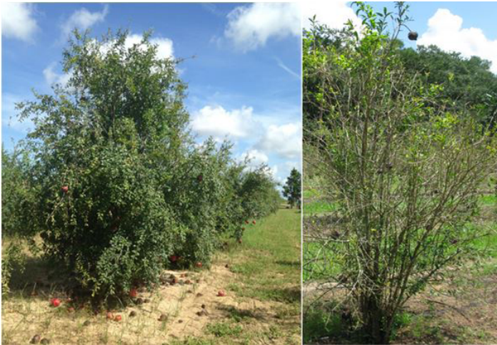
Figure 10. Fruit drop, fruit mummification, and defoliation of pomegranate in Florida orchards caused by combination of different pathogen species.