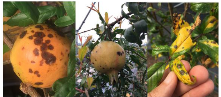
Figure 5. Fruit and leaf spot caused by P. punicae .