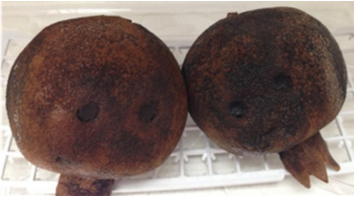
Figure 9. Fruit rot caused by Pilidiella granati . Black dots are the pycnidia on fruit surface.