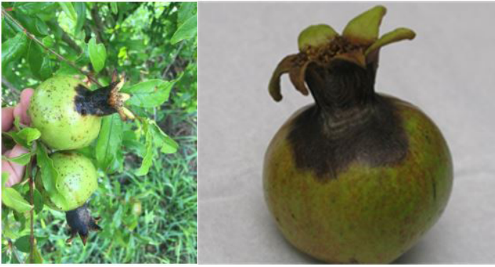
Figure 1. Fruit tip dieback of pomegranate caused by Colletotrichum spp.