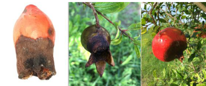
Figure 7. Pomegranate fruits at several stages infected by D. punicae .