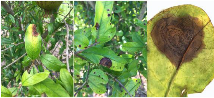
Figure 6. Leaf spots caused by Dwiroopa punicae with a close up on the lesion showing pycnidia as black dots on its center.

Dwiroopa punicae , a novel fungal species belonging to the order Diaporthales, is also associated with leaf spot and fruit rot on pomegranate (Xavier et al. 2019b). Leaf spots associated with this fungus are oval and brown, vary from 0.1 to 1.5 cm in diameter, and appear scattered on the leaf surface (Figure 6). Abundant black pycnidia (resembling little black dots) become visible on the lesion center (Figure 6, last on the right). The symptoms caused by D. punicae on the fruit start as small brown lesions on the fruit calyx at different stages (Figure 7).