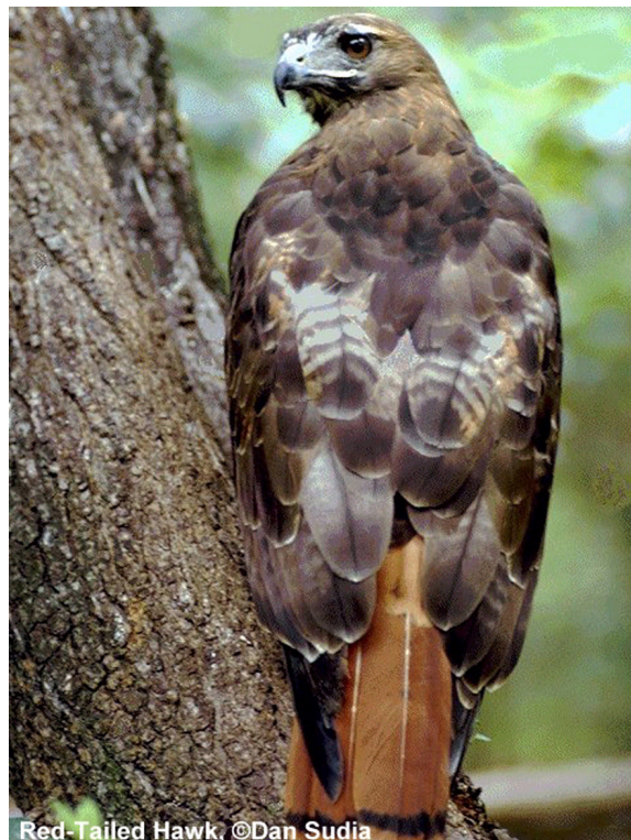
Figure 1. Red-tailed Hawk ( Buteo jamaicensis ).

Imagine a Carolina Wren ( Thryothorus ludovicianus ) and a Red-tailed Hawk ( Buteo jamaicensis ) flying over your neighborhood (Figures 1 and 2). Both species are found in certain areas of an urban environment. Take any Florida city, and certain neighborhoods will contain more Carolina Wrens or Red-tailed Hawks than other neighborhoods.