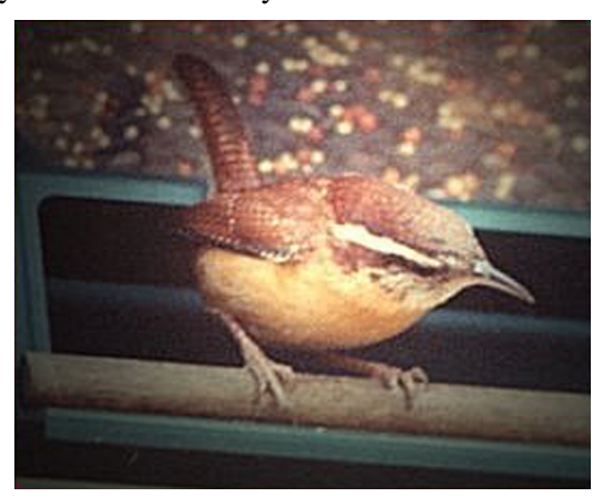
Figure 2. Carolina Wren (Thryothorus Iudovicianus)

hometowns for our feathered friends. But what is good habitat for a Carolina Wren versus a Red-tailed Hawk? How does each select a habitat for foraging or breeding? Do they have different criteria when selecting a particular area? Why would a bird select one yard versus another yard?