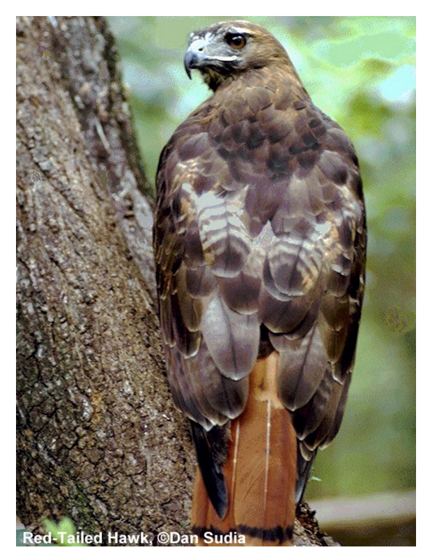
Figure 1. Red-tailed Hawk ( Buteo jamaicensis ).

Imagine a Carolina Wren ( Thryothorus ludovicianus ) and a Red-tailed Hawk ( Buteo jamaicensis ) flying over your neighborhood (Figures 1 and 2). Both species are found in certain areas of an urban environment. Take any Florida city, and certain neighborhoods will contain more Carolina Wrens or Red-tailed Hawks than other neighborhoods.