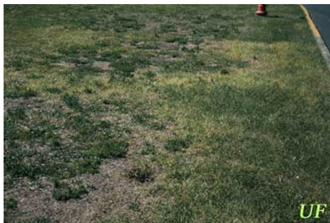
Figure 3. Patches of yellowing, dying or unthrifty grass are often typical of lance nematode damage, seen here in St. Augustinegrass.

H. galeatus may attach itself to the roots by embedding its anterior end, or sometimes its entire body, inside. As it feeds, it destroys the root system,