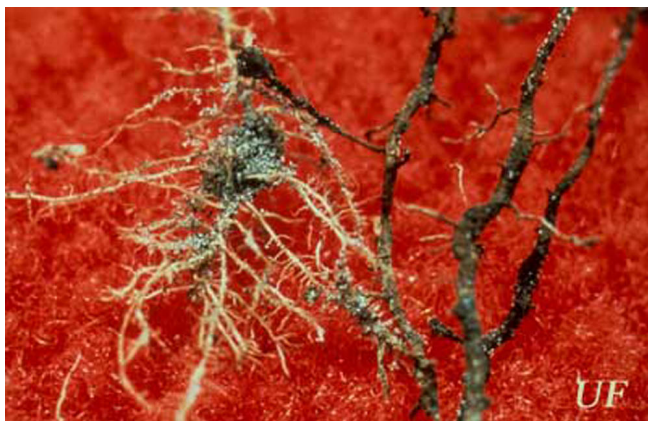
Figure 2. Compared with the healthy St. Augustinegrass roots on the left, the lance nematode-damaged roots on the right appear dark and are missing small feeder roots.

Damage may show up as patches of yellowing, dying or unthrifty grass, not unlike that caused by chinch bugs or some fungal pathogens. These symptoms also can be caused by drought or nutrient deficiency. Examination of the roots of a lance nematode-infested lawn often will reveal thorough damage to the root system. Small feeder roots are gone, and root tips appear dead. If new roots have begun to grow, they usually are injured as well. It is this damage to the root system that is responsible for the yellow or dying patches of grass.