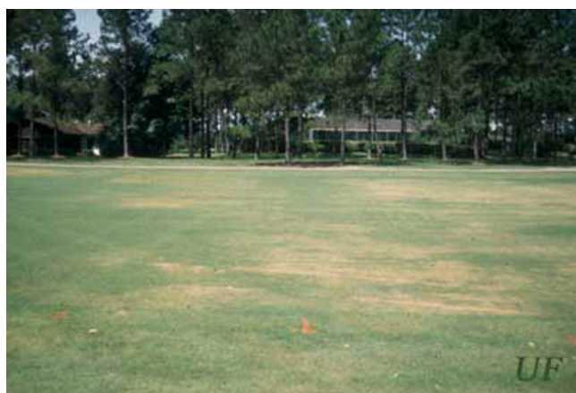
Figure 4. This Bermudagrass shows typical signs of damage from the lance nematode, the most common nematode pest on Bermudagrass putting greens in Florida.

causing outer layers of the dead roots to slough away. This kind of damage is often a sign of lance nematode infestation but may also be caused by fungal root rot.