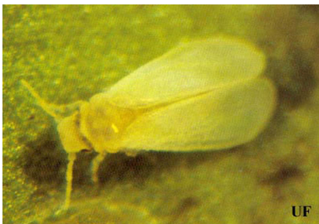
Figure 4. Adult of the bayberry whitefly, Parabemisia myricae (Kuwana).