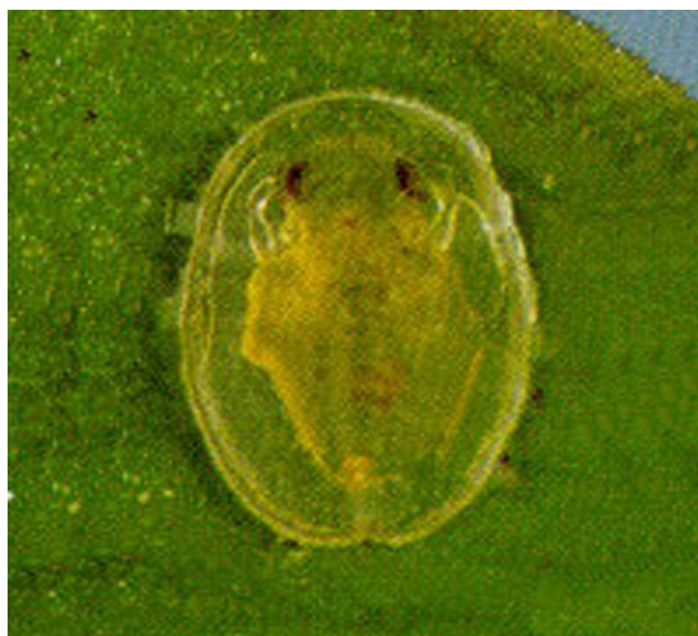
Figure 3. Nymph of the bayberry whitefly, Parabemisia myricae (Kuwana).

serrata , Rhododendron sp., Salix babylonica , and Salix gracilistyla . The most favored hosts are Citrus spp. and gardenia .