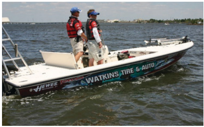
Figure 2. For-hire requirements differ when targeting inshore versus reef species.