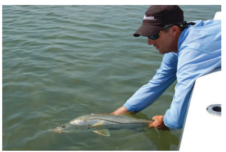
Figure 1. Managing a successful for-hire guide business requires much more than just catching fish.