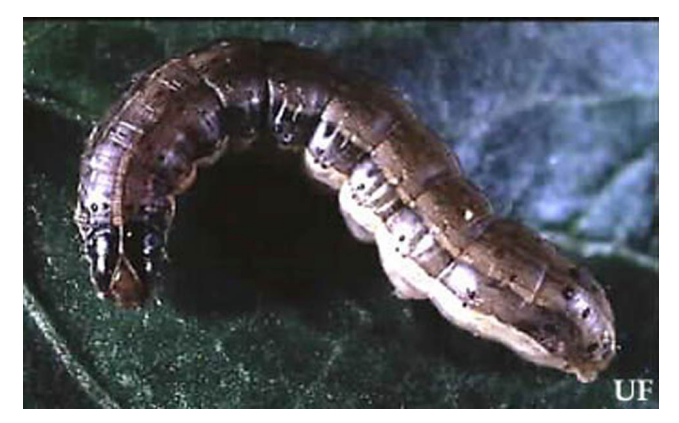
Figure 2. larva of fall armyworm, Spodoptera frugiperda (J.E. Smith), note light-colored inverted "Y" on front of head.