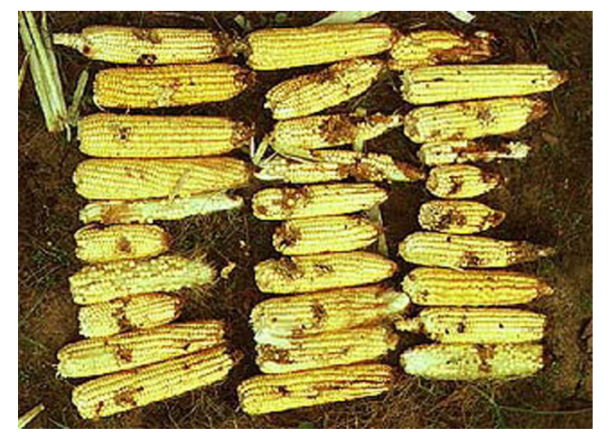
Figure 7. Corn cob damage caused by the fall armyworm, Spodoptera frugiperda (J.E. Smith).

Cool, wet springs followed by warm, humid weather in the overwintering areas favor survival and reproduction of fall armyworm, allowing it to escape suppression by natural enemies. Once dispersal northward begins, the natural enemies are left behind. Therefore, although fall armyworm has many natural enemies, few act effectively enough to prevent crop injury.