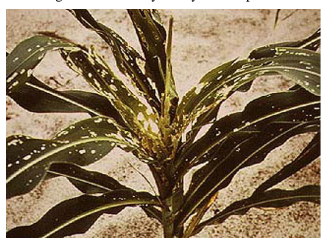
Figure 6. Corn leaf damage caused by the fall armyworm, Spodoptera frugiperda (J.E. Smith).

densities are usually reduced to one to two per plant when larvae feed in close proximity to one another, due to cannibalistic behavior. Older larvae cause extensive defoliation, often leaving only the ribs and stalks of corn plants, or a ragged, torn appearance. Marenco et al. (1992) studied the effects of fall armyworm injury to early vegetative growth of sweet corn in Florida. They reported that the early whorl stage was least sensitive to injury, the midwhorl stage intermediate, and the late whorl stage was most sensitive to injury. Further, they noted that mean densities of 0.2 to 0.8 larvae per plant during the late whorl stage could reduce yield by 5 to 20 percent.