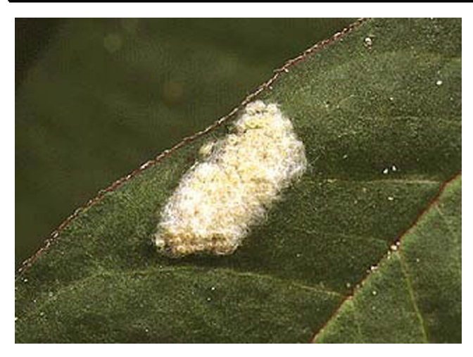
Figure 1. Egg mass of the fall armyworm, Spodoptera frugiperda (J.E. Smith).