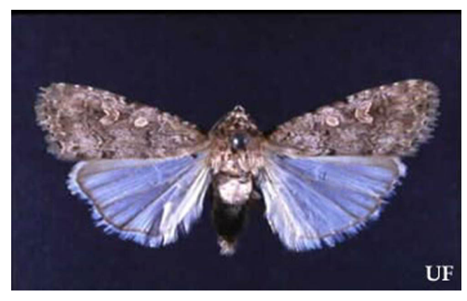
Figure 5. Typical adult female fall armyworm, Spodoptera frugiperda (J.E. Smith).

A comprehensive account of the biology of fall armyworm was published by Luginbill (1928), and an informative synopsis by Sparks (1979). Ashley et