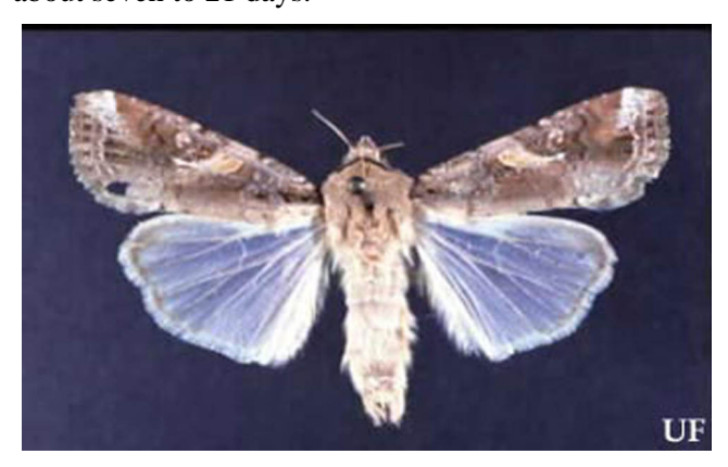
Figure 4. Typical adult male fall armyworm, Spodoptera frugiperda (J.E. Smith).

The moths have a wingspan of 32 to 40 mm. In the male moth, the forewing generally is shaded gray and brown, with triangular white spots at the tip and near the center of the wing. The forewings of females are less distinctly marked, ranging from a uniform grayish brown to a fine mottling of gray and brown. The hind wing is iridescent silver-white with a narrow dark border in both sexes. Adults are nocturnal, and are most active during warm, humid evenings. After a preoviposition period of three to four days, the female normally deposits most of her eggs during the first four to five days of life, but some oviposition occurs for up to three weeks. Duration of adult life is estimated to average about 10 days, with a range of about seven to 21 days.