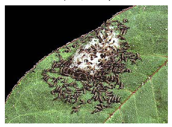
Figure 3. Hatching first instar larvae of the fall armyworm, Spodoptera frugiperda (J.E. Smith). Credits: USDA