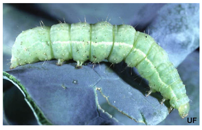
Figure 2. Mature larva of the cabbage looper, Trichoplusia ni (Huebner).