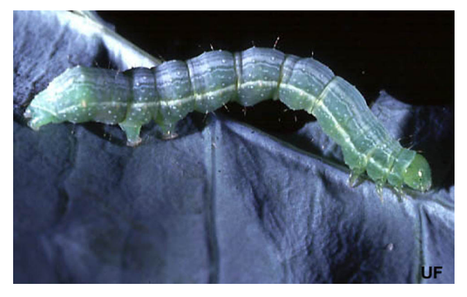
Figure 1. Early instar larva of the cabbage looper, Trichoplusia ni (Huebner).

At pupation, a white, thin, fragile cocoon in formed on the underside of foliage, in plant debris, or among clods of soil. The pupa contained within is initially green, but soon turns dark brown or black. The pupa measures about 2 cm in length. Duration of the pupal stage is about four, six, and 13 days at 32, 27, and 20 degrees C, respectively.