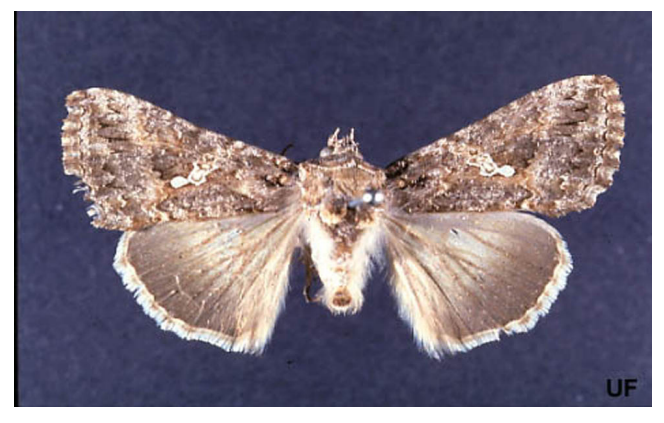
Figure 4. Adult cabbage looper, Trichoplusia ni (Huebner).