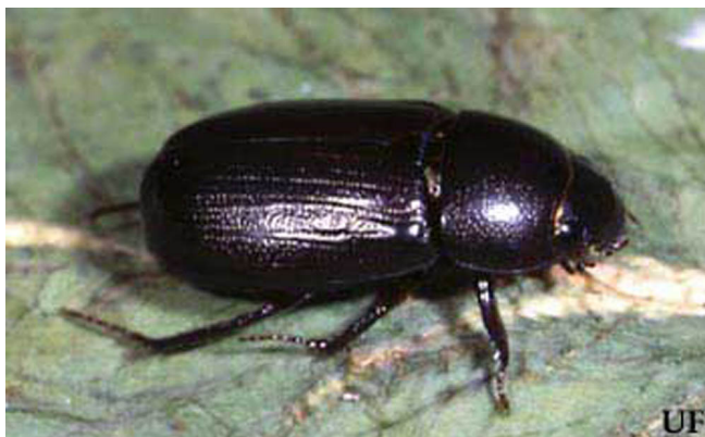
Figure 2. Adult rice beetle, Dyscinetus morator (Fab.).