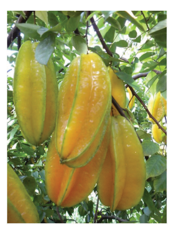
Figure 1. 'Arkin' carambola tree in flower and 'Kary' carambola fruit.

Carambola trees are highly sensitive to windy and cold conditions; production and fruit quality benefit greatly from natural or man-made wind protection and growing sites with little to no cold or freezing temperatures (Crane 2016). There are two main types of carambola, i.e., sweet and tart. Sweet ones are generally savored as fresh fruits, and tart-flavored ones are generally used in the processed food industry. Major sweet carambola cultivars are 'Arkin' and 'Kary'. Minor cultivars include 'Fwang Tung' and 'B-10' (Cooper et. al. 2013; Crane 2016). Carambola has two harvest seasons. The first is from late June through