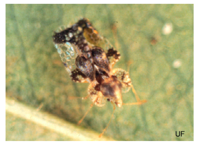
Figure 1. Adult of the hawthorn lace bug, Corythucha cydoniae (Fitch).

egg and nymphal stages of C. cydoniae and related species. Other hosts of this lace bug are sometimes attacked by similar species; therefore, host identification alone is not adequate for identifying the hawthorn lace bug. Field identification of adults is difficult because thre are several similar species. Specimens are small and pigmentation is variable within a species. The most valuable diagnostic character is the straight hind margin of the apical, elytral crossbar. The following diagnosis (modified from Blatchley 1926) distinguishes C. cydoniae from other species of Corythucha .