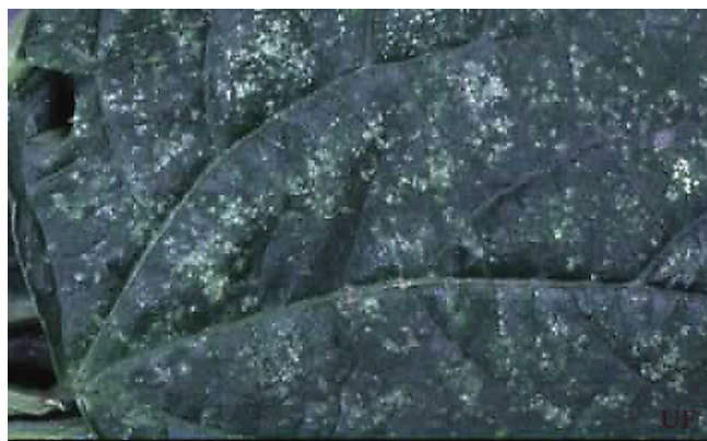
Figure 5. Leaf spotting caused by feeding of garden fleahopper, Halticus bractatus (Say).

Nymphs and adults frequent the stems and surfaces of plant leaves, sucking the sap from individual cells and causing their death. The result is a whitish or yellowish speckling on the foliage. Extensive feeding may cause stunting of plant growth and death of seedlings. Deposition of black spots of fecal material on the plant by both nymphs and adults also detracts from the appearance and marketability of vegetables.