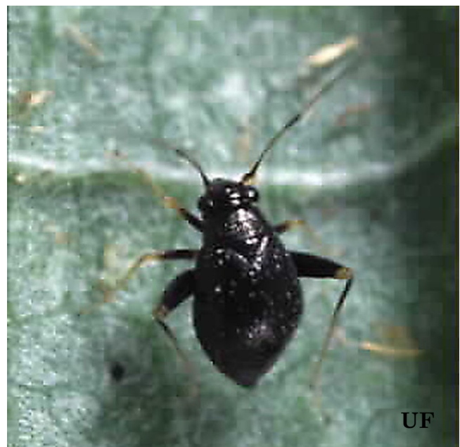
Figure 3. Brachypterous (short-winged) adult female garden fleahopper, Halticus bractatus (Say).

The adults are shiny black in color, with some yellow on the antennae and legs. Garden fleahopper adults occur in three forms: brachypterous (short-winged) females (Figure 3), macropterous (long-winged) females, and macropterous males (Figure 4). The males are thin, measuring about 1.9 to 2.1 mm in length and 0.7 mm in width. The females are more robust, the brachypterous form measuring about 1.6 mm in length and the macropterous form measuring about 2.2 mm in length, with both forms about 1.0 mm in width. Females generally are brachypterous. The adults have greatly expanded hind femora and hop when disturbed. Thus, in both behavior and form (especially the brachypterous females) the fleahoppers resemble flea beetles. The long antennae of fleahoppers exceed the length of the body; this helps to distinguish fleahoppers from flea beetles, which have antennae less than half the length of the body. Fleahoppers and flea beetles also differ in their mouthpart configuration, having piercing-sucking and chewing mouthparts, respectively.