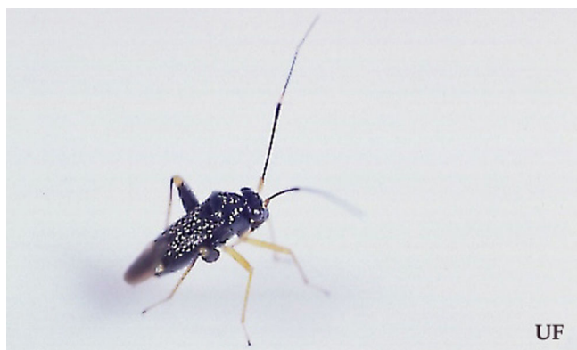
Figure 4. Macropterous (long-winged) adult male garden fleahopper, Halticus bractatus (Say). Credits: Paul M. Choate, University of Florida