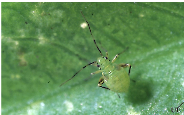
Figure 2. Nymph of garden fleahopper, Halticus bractatus (Say).

instar, however, a black dot is present on the sides of the prothoracic segment; the black spots persist through the remaining nymphal stages. In the fourth instar, wing pads are apparent, and extend back over the first abdominal segment. During the last instar the wingpads extend over about half of the abdominal segments. In females which are brachypterous (short-winged) as adults, the wings pads in the fifth instar tend to be slightly less than one-half the length of the abdomen. In males, or females which will be macropterous (long-winged) as adults, the wing pads in the fifth instar tend to be slightly longer than one-half the length of the abdomen. The mean duration of each instar is about 8.3, 9.9, 7.8, 5.8, and 7.2 days, respectively. Body length of each instar is about 0.7, 0.8, 1.0, 1.2, and 2.0 mm, respectively.