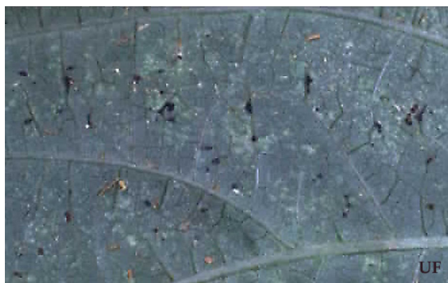
Figure 6. Fecal spots from the garden fleahopper, Halticus bractatus (Say), on underside of leaf.