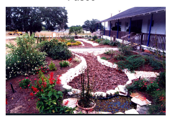
Figure 22. Pasco County Extension Garden