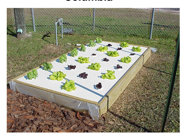
Figure 2. Vegetable plot in Columbia County Extension Garden