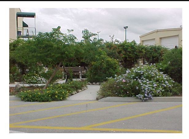
Figure 13. Lee County Extension Garden

Four gardens on the Extension office grounds include: a seasonal vegetable garden, a butterfly garden, a palm garden and a grape arbor. They are maintained by Master Gardeners.