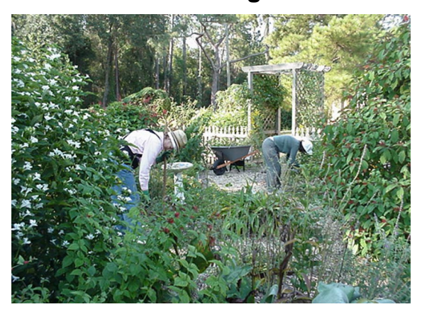
Figure 8. Master Gardeners in the Hillsborough County Extension Garden