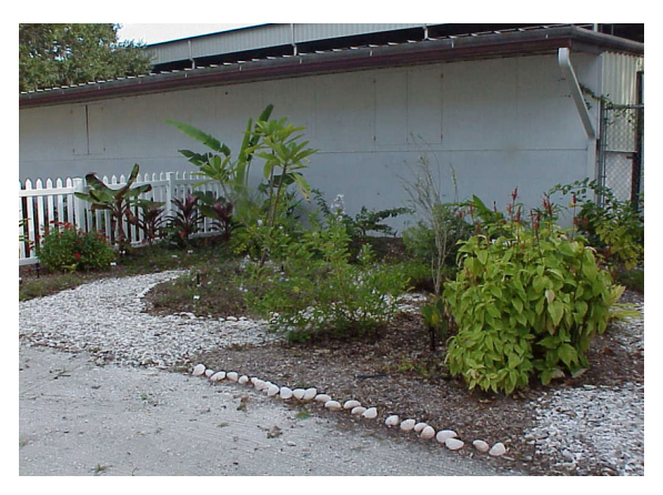
Figure 15. Beach plant area in the Manatee County Extension Garden