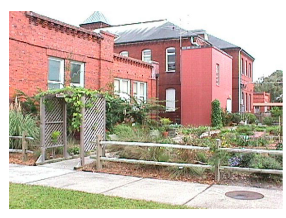
Figure 28. Seminole County Student Museum and Extension Garden