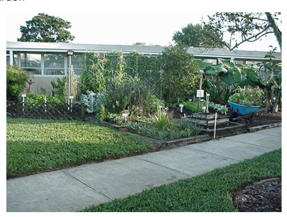
Figure 21. Orange County Extension Garden