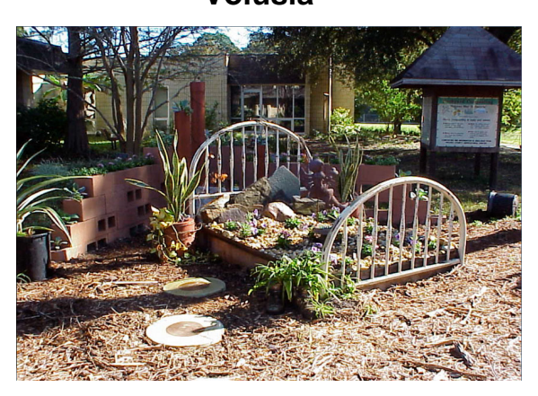
Figure 32. Volusia County Extension Garden