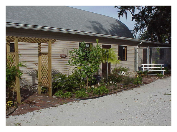
Figure 14. Backdoor at the Manatee County Extension Garden