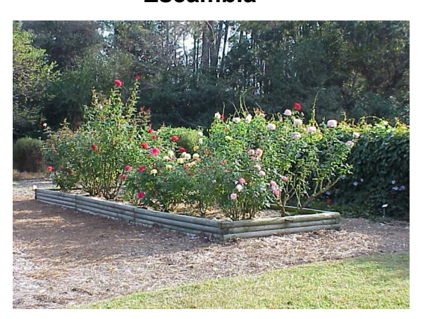
Figure 5. Roses in Escambia County Extension Garden