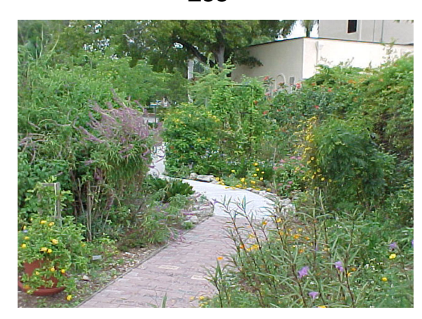
Figure 11. Lee County Extension Garden