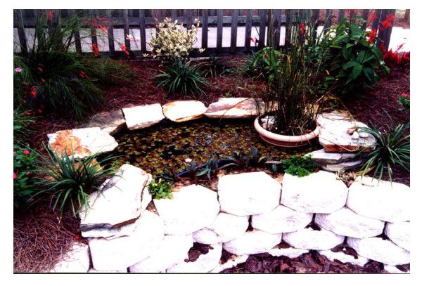
Figure 23. Pasco County Extension Garden