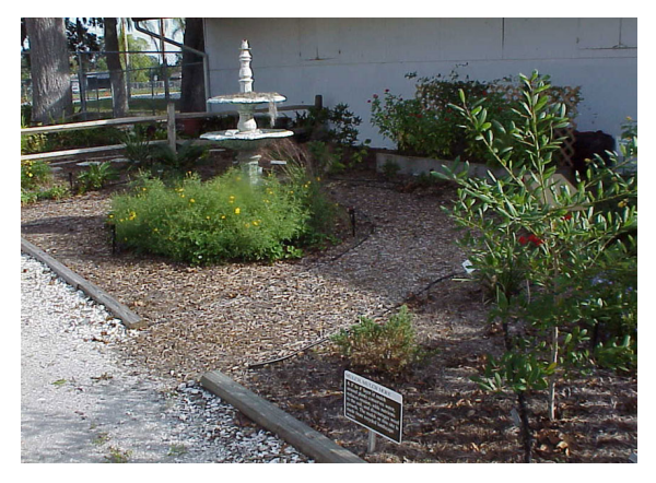
Figure 17. Manatee County Extension Garden