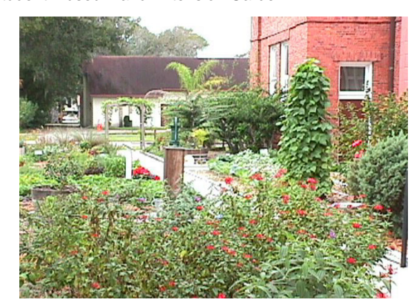
Figure 30. Butterfly Garden at the Student Museum in Seminole County

Demonstration Gardens at the Student Museum