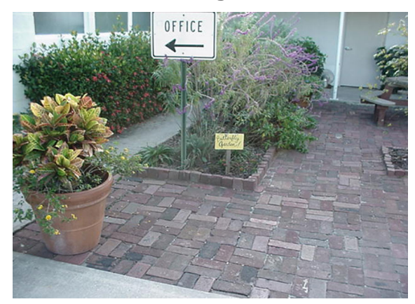
Figure 19. Orange County Extension Garden