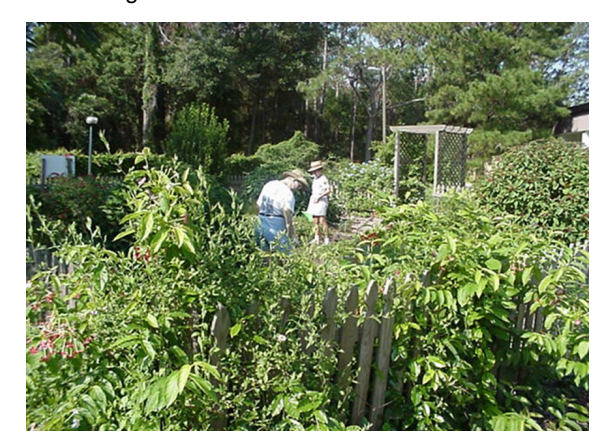
Figure 10. Hillsborough County Extension Garden