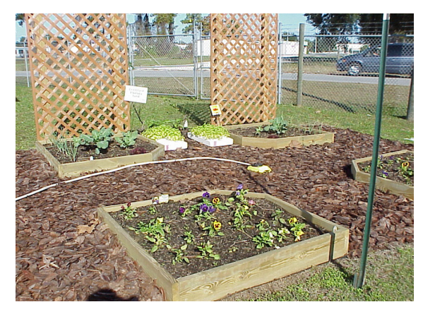
Figure 3. Trellis system in Columbia County Extension Garden