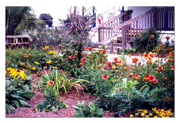
Figure 24. Perennials in Pasco County Extension Garden