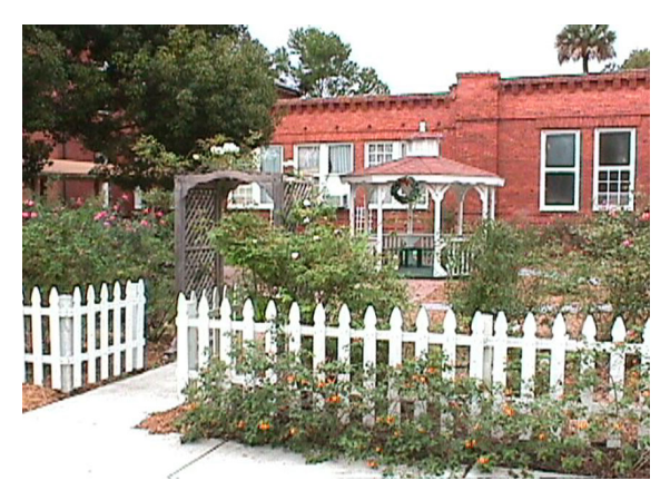
Figure 31. Roses at the Student Museum and Extension Garden in Seminole County