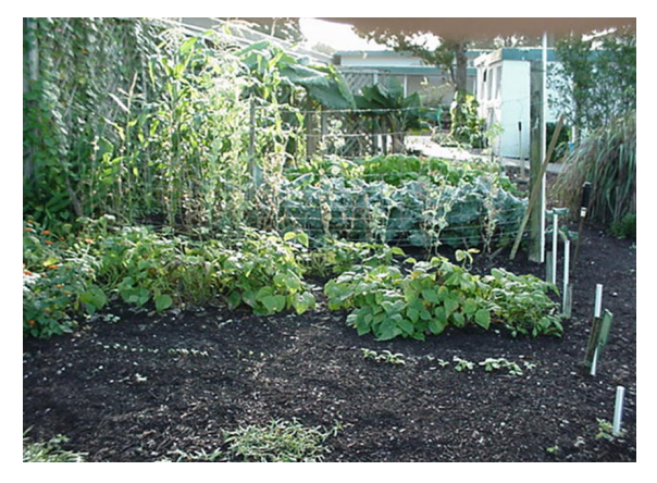
Figure 20. More vegetables in Orange County Extension Garden