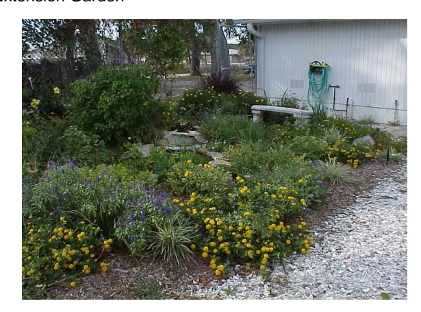
Figure 16. Manatee County Extension Garden

Developed, planted and maintained by Master Gardeners, these gardens include: a beach garden with salt-tolerant and drought-tolerant plants, East and West Manatee gardens with plants that do well in these respective locations, a pond garden, a shade garden, a backdoor garden with edibles and a low-volume irrigation demonstration.