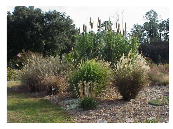
Figure 6. Grasses in Escambia County Extension Garden