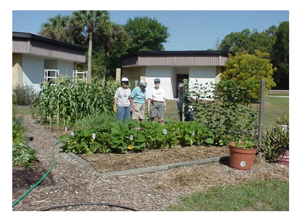
Figure 9. Master Gardeners in the Hillsborough County Extension Vegetable Garden