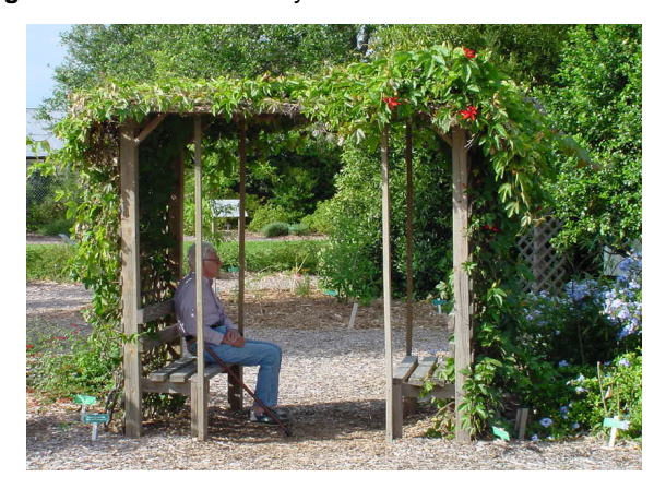
Figure 27. Visitor resting in the Sarasota County Extension Garden