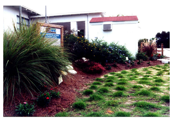
Figure 25. Grasses at the Pasco County Extension Garden