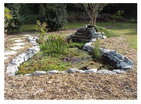
Figure 7. Extension Water Garden in Escambia County

A joint effort between the Escambia County Master Gardeners and local vocational technical school, the garden features eleven areas including: vegetables, roses, native plants, ornamentals, day lilies, mulches, bogs and grasses.