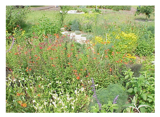
Figure 18. Marion County Demonstration Garden