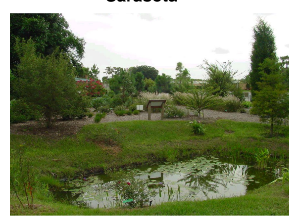
Figure 26. Sarasota County Extension Garden