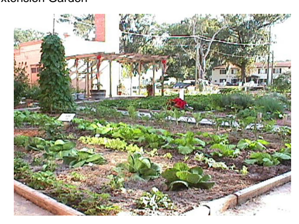
Figure 29. Pioneer Garden at the Seminole County Student Museum and Extension Garden