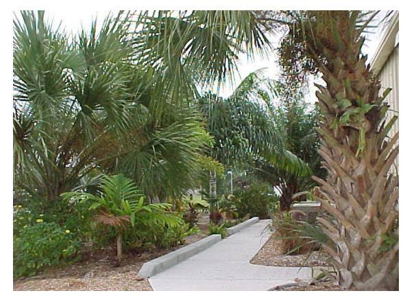
Figure 12. Palms in Lee County Extension Garden