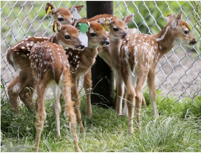
Figure 3. Group of healthy white-tailed deer fawns.

Because of the complexity of diarrheal diseases in newborn and young fawns, it is unrealistic to expect total prevention. The objectives are to reduce the clinical disease, to minimize the level of exposure to infectious agents, and to increase resistance in the fawns.