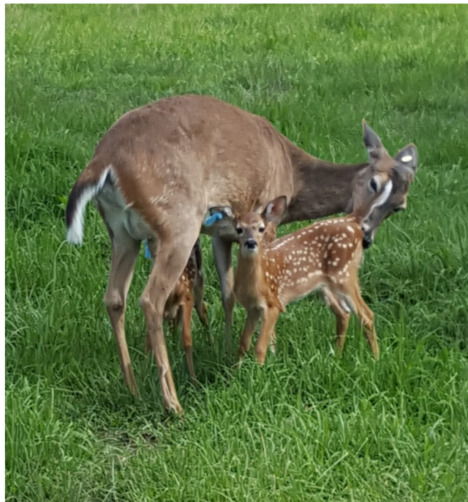
Figure 2. Twin healthy white-tailed deer fawns with their mother. Licking is important not just to keep fawns clean, but to stimulate them to defecate and urinate.

It is extremely important to ensure that fawns take plenty of colostrum in the first hours after they are born. Taking steps to minimize stress to does near the time of parturition—for instance, refraining from moving pregnant does to a new herd and ensuring that their pens are clean and quiet—may improve their fawns' uptake of colostrum. Similarly, it is very important to incorporate a management procedure that detects fawns that are not taking