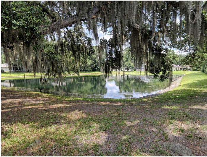
Figure 1. A typical stormwater pond in a Florida community. Note the bank erosion and lack of plantings along its perimeter.

Baker 2007), pond construction and design/shape (Kehoe 1993; Walker 1997; Persson and Wittgren 2003), load (Persson and Wittgren 2003), and the presence of a littoral zone (Stormwater Academy 2005).