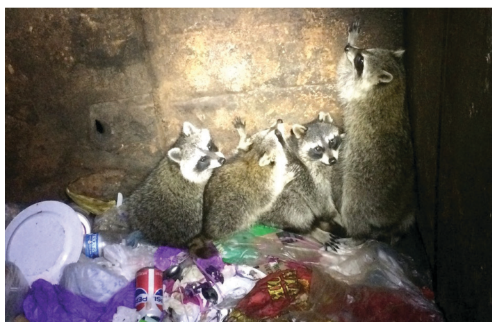
Figure 5. A group (gaze) of five raccoons in a dumpster, a common gathering spot.

other adaptable species increases. Raccoons readily adapt to urban environments (Figure 5), thus increasing the chance for raccoon-borne diseases to spread to humans and pets. There are a few simple solutions to prevent the spread of raccoon-borne diseases. First, never feed wild animals. In addition to being illegal, feeding wildlife causes animals to associate humans with food, and sometimes to become dependent upon humans. They may lose their natural fear, and they may become aggressive. Feeding wildlife also increases population density and territorial overlap, and the chances of disease transmission between individuals. In addition to not feeding wildlife, feed pets inside, or at least bring food in at night. Purchase raccoon-proof garbage cans if they are getting into your garbage. If you have an unwanted raccoon on your property, call a wildlife removal specialist. The Florida Fish and Wildlife Conservation Commission keeps a list of wildlife removal specialists on their website. Removing a raccoon without professional assistance is difficult and risky, and there is a very high chance the raccoon will come back, or that you remove only part of a family and leave orphans.