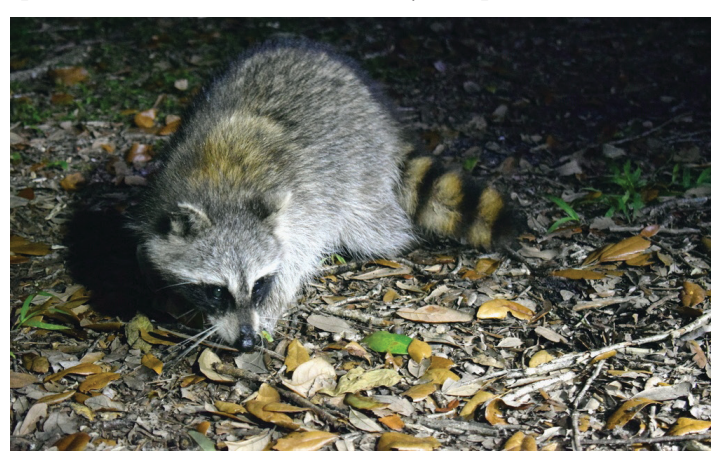
Figure 1. A young female raccoon in Broward County, south Florida.

Salmonella , tularemia, Edwardsiella septicemia , and leptospirosis (See Table 1 for a summary and prevention).