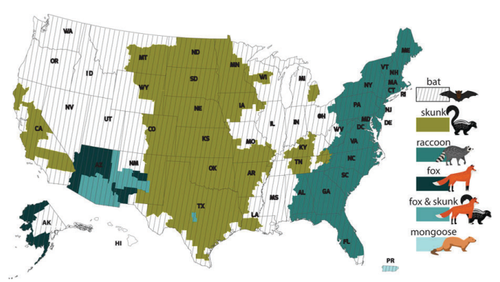
Figure 2. Rabies virus variants associated with bats and major medium-sized carnivore species in the United States.

Rabies can cause aggressive behavior and excessive salivation; however, these are by no means the only symptoms. A rabid animal may also act tame, become active at unusual hours, or exhibit neurological abnormalities. Raccoons will occasionally forage for food during the day if it is quiet, so a daytime sighting of a raccoon is not cause for alarm on its own. If the raccoon shows no fear of humans or exhibits neurological abnormalities, however, it could be rabid. Either way, raccoons, like all wild animals, should be avoided.