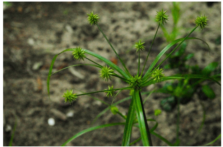
Figure 6. Globe sedge ( Cyperus croceus ) is often mistaken as yellow nutsedge.

Yellow nutsedge has tiny, single-seeded fruit (achenes) that are triangular in cross-section, blunt-headed, and yellowish-brown in color. Purple nutsedge does not typically produce seeds in the United States (UC-IPM 2017). Reproduction by seed is typically not a concern for either species as seed production and viability is low.