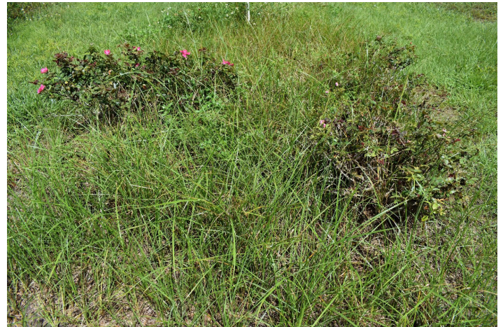
Figure 1. A rose garden heavily infested with both yellow and purple nutsedge.

Both species are prevalent in lawns, cultivated areas, turf areas, landscape beds, gardens, fields, pastures, roadsides, edges of forests, grasslands, riverbanks, irrigation canal banks, and disturbed areas (Figures 1 and 2). Both species are very persistent once established.