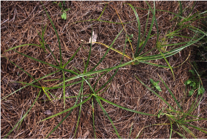
Figure 2. Yellow nutsedge growing in a landscape bed mulched with pine straw.