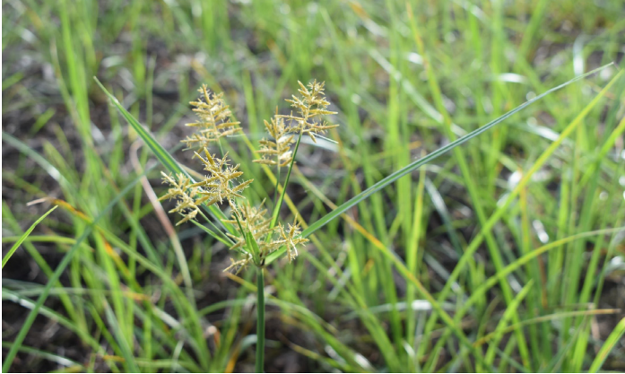
Figure 4. Yellow nutsedge inflorescence.

The inflorescence (flowers) of yellow nutsedge consists of an umbel (a cluster of flowers originating from a central point) of spikes distributed throughout stalks of unequal length (1–3 inches), are yellow-brown, golden, or straw colored, and are supported by leaf-like bracts as long or longer than the spikes (Bryson and DeFelice 2009) (Figure 4).