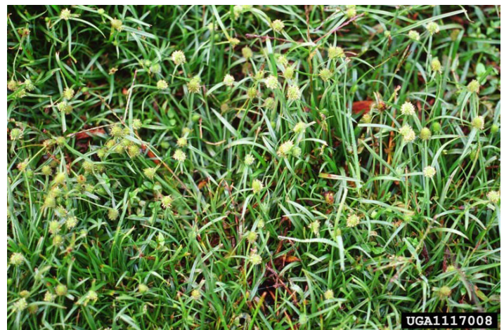
Figure 7. Kyllinga ( Kyllinga brevifolia ) is another sedge species that is often confused with nutsedge.