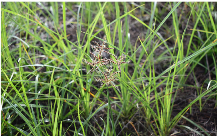
Figure 5. Purple nutsedge inflorescence.

Within the continental United States, the inflorescence of purple nutsedge is umbel-like and contains unequally stalked spikes. The spikes are reddish-purple or reddish-brown in color (Wills 1998) (Figure 5).